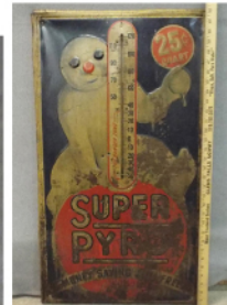
Super Pyro thermometer