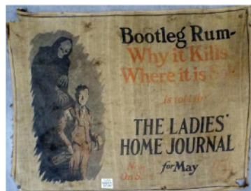
Pre prohibition banner for Ladies Home Journal