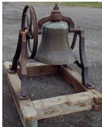
Bronze Maneelys, Foundry W. Troy, NY