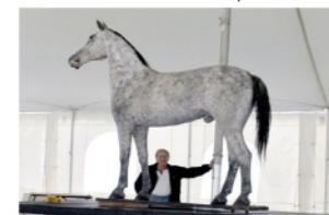
Life Size Wooden Horse