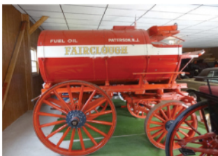
Studebaker Oil Tank Wagon