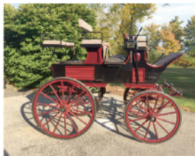
Roof Seat Break