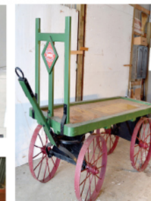
Railway Express Wagon