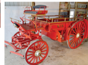
Fire Hose Wagon