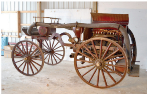
Waterous #6 Class B Pumper Wagon