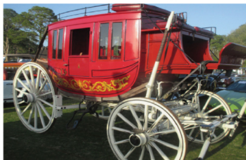
Restored Original Hotel Style Abbott & Downing Stage Coach Serial #476