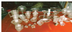
Good Luck Prayer Rug Horse Shoe Collection circa 1881