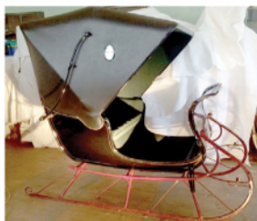
Sturtevant Larrabee Co Doctor's Sleigh w/Hood