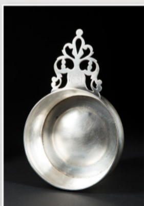
28. WILLIAM MOULTON SILVER PORRINGER