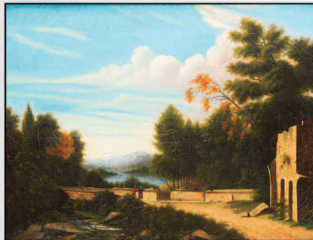
40. THOMAS COLE, NY (1801- 1848)