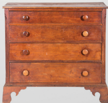
77. CHERRY CHIPPENDALE CHEST OF FOUR DRAWERS, C. 1800