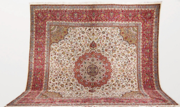
4. SILK AND WOOL TABRIZ ROOM SIZE ORIENTAL RUG