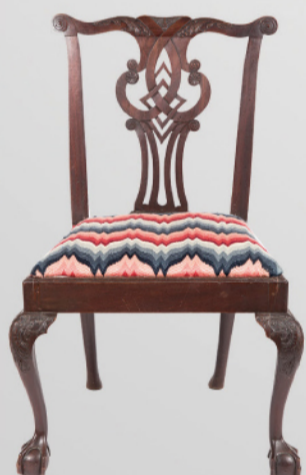
30. SET OF SIX ENGLISH CHIPPENDALE CARVED MAHOGANY SIDE CHAIRS