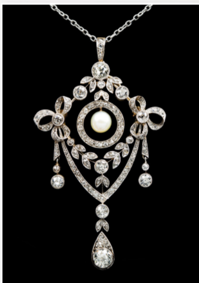
142. EDWARDIAN NECKLACE IN GOLD WITH DIAMONDS AND PEARL