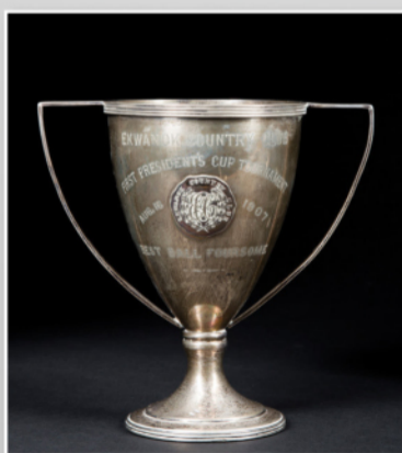
212. FIRST PRESIDENTS CUP TROPHY, 1907