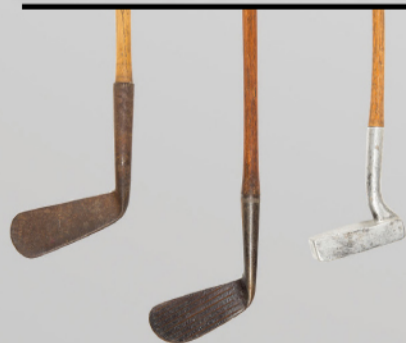
ANTIQUE GOLF CLUBS