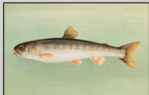
205. JOHNSON'S FOREST, LAKE, AND RIVER, 1902 FIRST EDITION