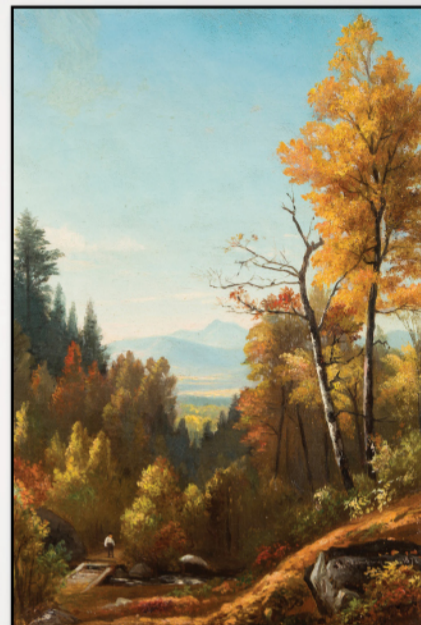
35. BENJAMIN CHAMPNEY, MA/NH, (1817-1907) MT. CHOCORUA