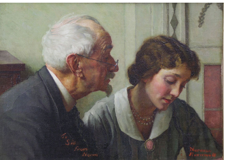
Norman Rockwell-My Neighbors