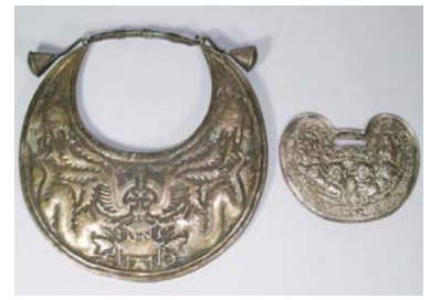
Tibetan Silver Ruyi Locks