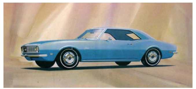
Chevy Camaro Poster