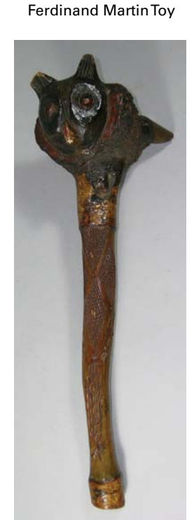
Penobscot Indian Root