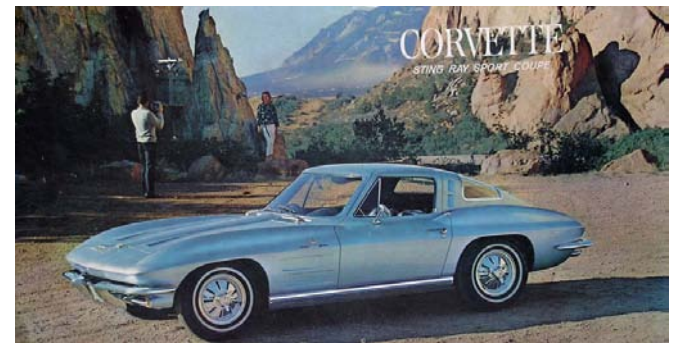
Chevy Corvette Poster