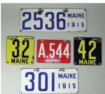
Maine License Plates