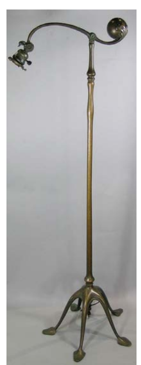
Tiffany Studios Floor Lamp