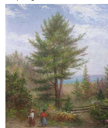
Mt. Desert-The Big Pine