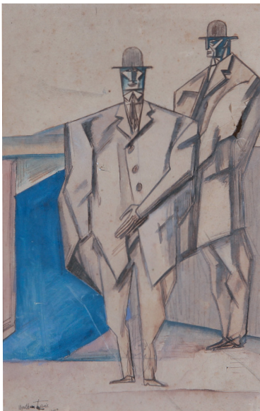
Wyndham Lewis (1886-1957) The Detectives , pen, brush, black ink, signed & dated 1912