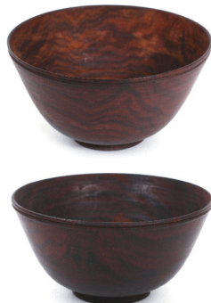
Chinese zitan wine cups, Qing Dynasty, 18th century