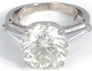
4.95ct round brilliant-cut diamond and platinum ring