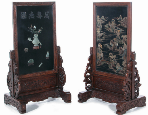
Rare pair Chinese jade and lacquer standing floor screens, Qing Dynasty