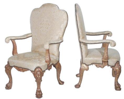
Morant & Co. giltwood armchairs, from 20th Century Fox Studios inventory

IMPORTANT THREE-DAY AUCTION - APRIL 7, 8 & 9 THURSDAY, FRIDAY & SATURDAY, 11AM EACH DAY Preview details can be found at www.charltonhallauctions.com