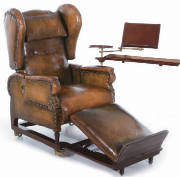
Marvelous Edwardian "Burlington" adjustable leather reading chair, J. Foot & Son, circa 1900