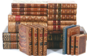
Fine leatherbound book collection