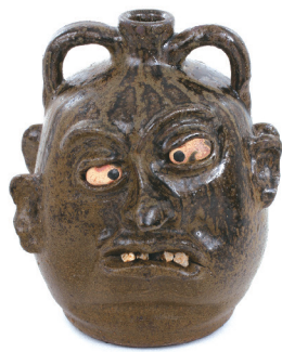
Southern face jug collection