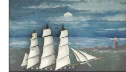
Maritime incl. Diorama