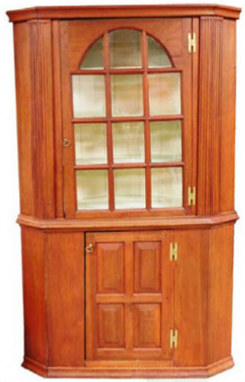
Barrel Back Cupboard

Art, American Antiques, Tribal, Maritime, Clocks, Jewelry, Silver, Vintage Clothing, Dolls, Etc.