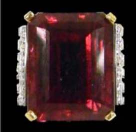
Rubellite Ring, 42 ct.