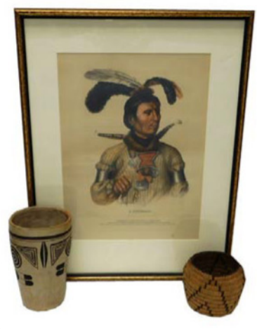
Amer. Indian Incl. 14 Lithos.