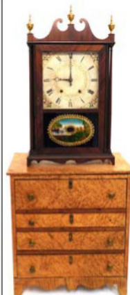
Fig. Maple/E. Terry