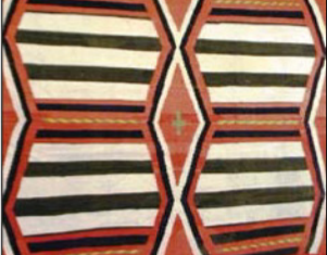
Navajo Third Phase