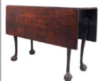
Chippendale w/Ownership Inscription