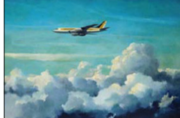
Eric Sloane (1 of 2)