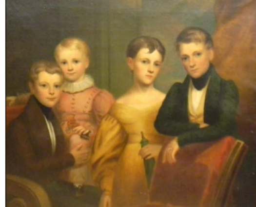
Amer. School, 35" x 41" (poss. Randalls, Brooklyn)