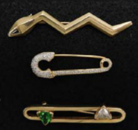
14K, Diamonds, Tsavorite