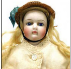
French & Others