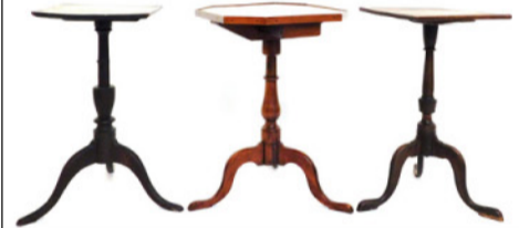
3 of 9 Candle Stands