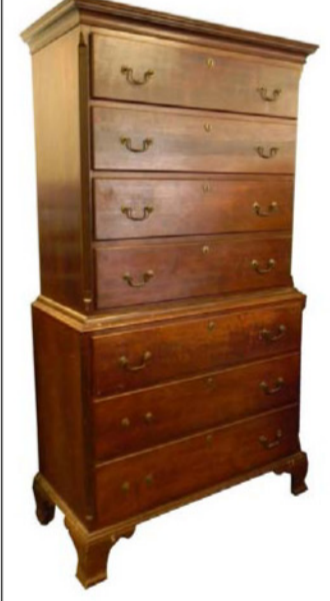
Conn. Chalk Inscription