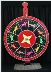
Horse Race Game Wheel