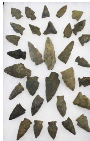
30+ lots of identified lithic points and artifacts

ANTIQUÉ FIREARMS: early 19th c Kentucky percussion rifle w/ full curly maple stock; historically important Maine percussion rifle, 62 cal, w/ old label "Carried in Aroostook War 1826 by William Beedle"; Whitney Phoenix .38 cal breech loading rifle; 19th c N. Kendall Windsor, VT underhammer percussion 45 cal oct barrel hunting rifle w/ curly maple stock; 19th c N. Kendall Windsor, VT percussion underhammer octagonal barrel target rifle, cal 45, 33" engr long barrel, original rear peep sight; 19th c New England percussion rifle, cherry half stock, 38" long, 45 cal, half oct barrel; rare Phoenix Model 1884 Plattsburgh, NY 40 cal single shot center fire breech loading rifle; US Springfield Model 1884 45/ 70 trapdoor musket; US Model 1842 Johnson pistol lock marked "Midd TN";