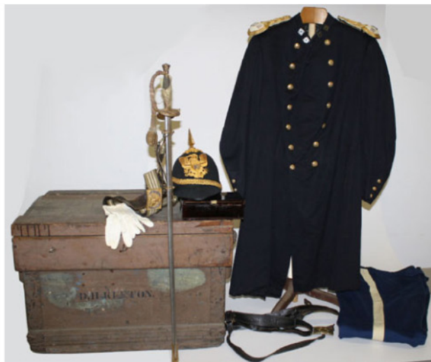
US pattern 1881 military uniform owned by Capt Dwight Kelton Montpelier VT