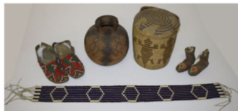
Collection of Native American First Nations artifacts including baskets wampum belt and moccasins