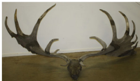
Prehistoric Irish Elk Antlers and skull