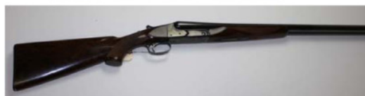
Winchester Model 21 Side by Side 12ga shotgun and other modern firearms