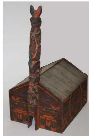
Northwest Coast lodge model with totem pole and polychrome decoration circa 1890-1900