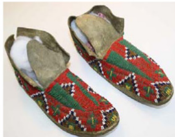
19th c Sioux moccasins

SEE WWW.MERRILLSAUCTION.COM FOR PHOTOS & LINK TO ON-LINE CATALOGUE