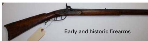
Early and historic firearms