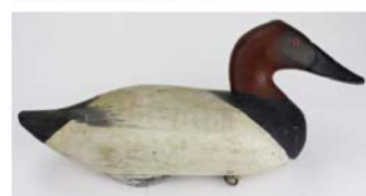
Many Decoys including Mitchell canvasback