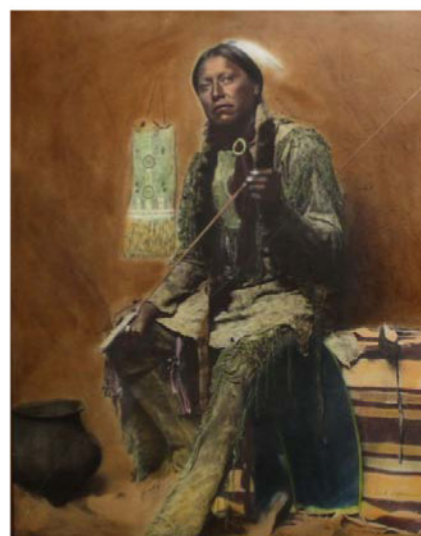
Carl Moon large format colored photo