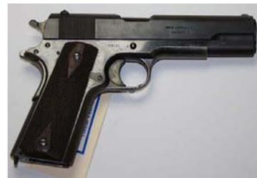
Colt Govt Model 1911 in 45 auto