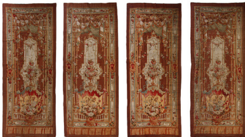
Four Aubusson tapestry panels inscribed Manu Royale d'Aubusson and dated 1741, 11'4" x 4'5" each

Long lost set from the Henry C. Gibson house in Philadelphia