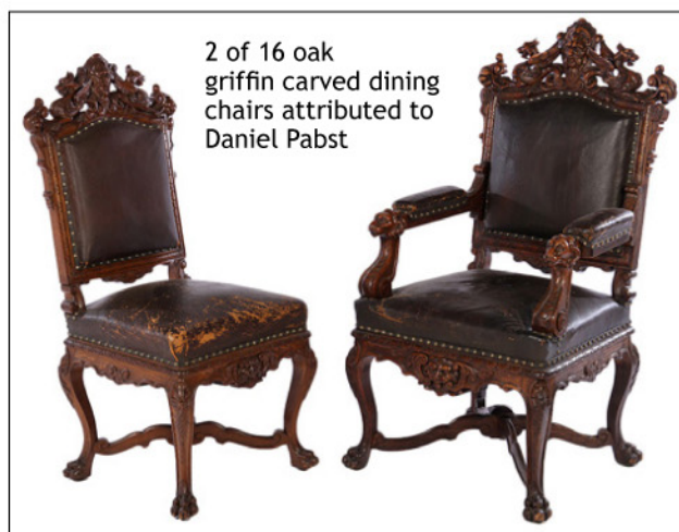
2 of 16 oak griffin carved dining chairs attributed to Daniel Pabst