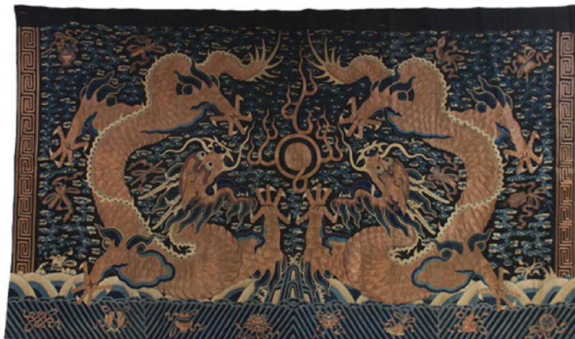
19th century Chinese 6'2" x 10'6"

PREVIEW: MARCH 16-19 & MARCH 21ST from 10AM – 5PM