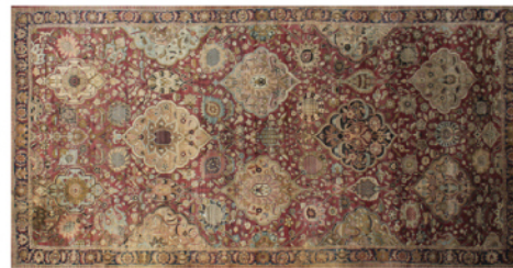
20 Ft. Carpet