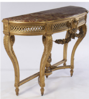
Pair of 53 In. French Giltwood Consoles