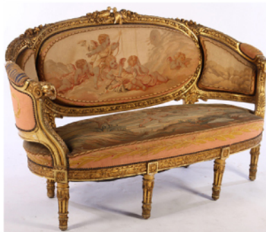
Giltwood Aubusson Sofa