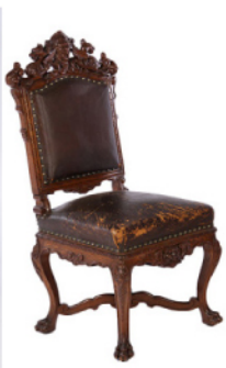
Daniel Pabst Set of 18 Oak Dining Chairs