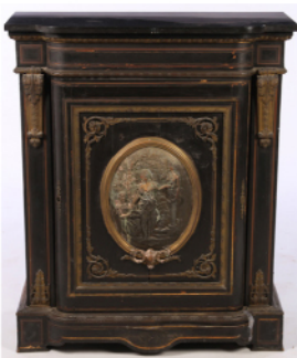
Napoleon III Cabinet