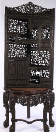
19th C. Chinese Hardwood Corner Cabinet