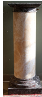
Pair Marble & Onyx Pedestals