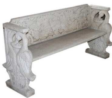
Swan Carved Marble Bench