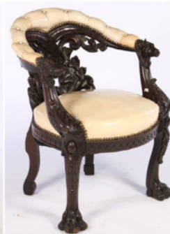
4 G. Henkels Horse Head Chairs