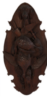
47 In. Pair 19th C. Walnut Plaques