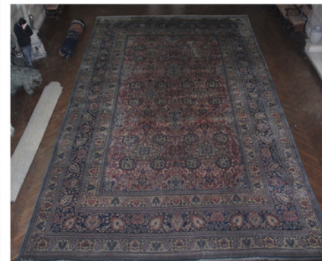
29 Ft. Carpet

PREVIEW: MARCH 16-19 & MARCH 21ST from 10AM – 5PM