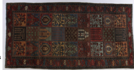
10 Ft. Carpet