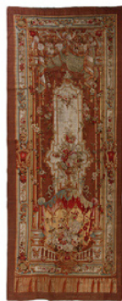
Rare Set of 4 Aubusson Tapestry Entre Fenetre Panels Dated 1741