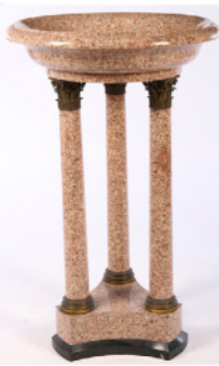
Bronze & Granite Roman Style Font