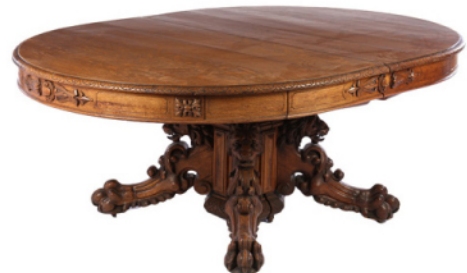
Daniel Pabst 20 Ft. Oak Table