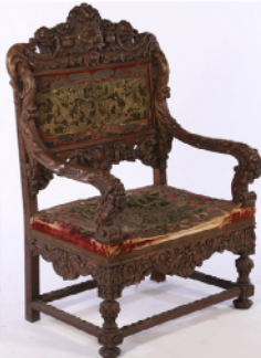
Pair 19th C. Walnut