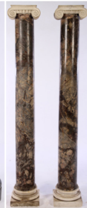
4 Marble Columns Carved Capitals