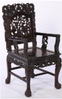
Pair 19th C. Hardwood Chairs