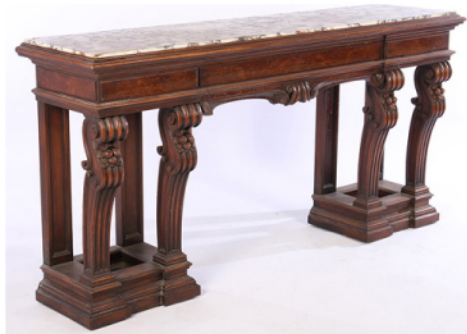
72 In. Mahogany Marble Top Console