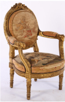
4 Giltwood Aubusson Armchairs