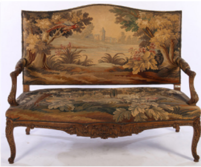
Verdure Tapestry Settee