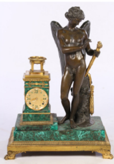
36 In. Malachite Bronze Clock