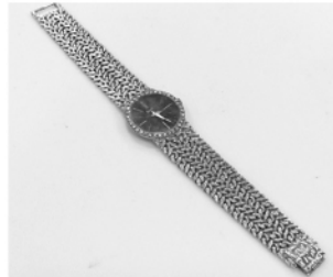
Vintage Piaget Diamond & Jade Ladies Watch