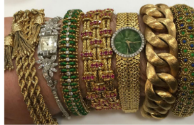
Assorted Tiffany & Co Enamel Bracelets- Gold Jewelry