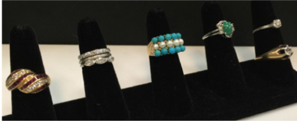
Assorted Estate Rings - Tiffany & Co - Antique

83 Harvard Avenue, Stamford, CT 06902 GreenwichAuction.net • 203.355.9335 • GreenwichAuction.net