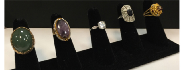
Assorted Estate Rings - Tiffany & Co - Antique