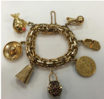
Solid 18Kt Gold Charm Bracelet - 5.3 oz