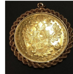
18Kt Gold 1915 Austrian Coin