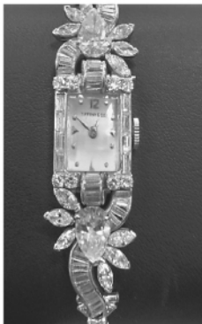
Vintage Tiffany & Co Diamond Ladies Watch