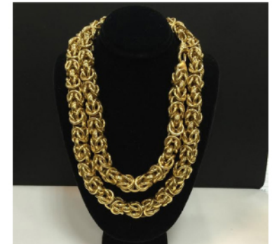
Estate Woven Yellow Gold 32 Inch Necklace - 5 oz

BIDDING AVAILABLE ON LIVEAUCTIONEERS, INVALUABLE & AUCTIONZIP • TELEPHONE & ABSENTEE AVAILABLE ON ALL LOTS!