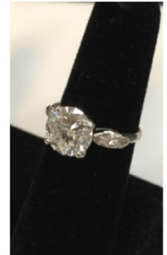
Approx. 3 Carat Center Stone Platinum Ring

I-95 Going South: EXIT 6: At second light take a right and immediate left into our lot. I-95 Going North: EXIT 6: At end ramp take a left under 95 & turn left into our lot. We are located in the very back of the lot, behind Ring's End Point. Stairs to main entrance by garage on left.