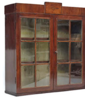
19th C. Federal Hanging Cupboard