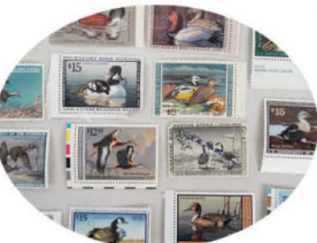
Collection of Duck Stamps