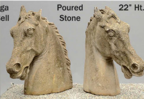
Poured Stone 22" Ht.