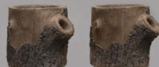
Stone Tree Stump Planters