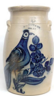
White & Son, Utica N.Y.