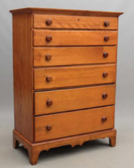
19th C. Tall Chest