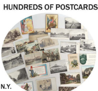
HUNDREDS OF POSTCARDS