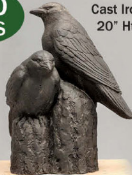
Cast Iron 20" Ht.