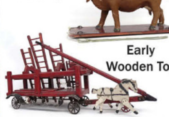
Early Wooden Toy