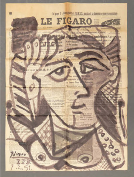
Attributed or after Pablo Picasso