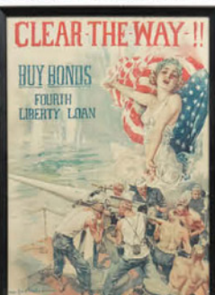
War Bonds Posters