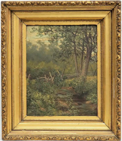
Jervis McEntee (1828-1891)