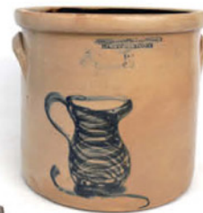
Seymour & Bosworth (CT)