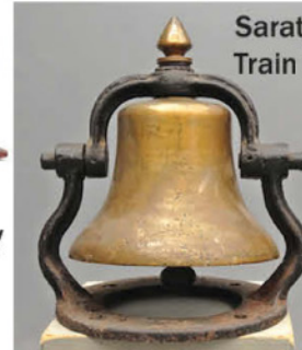
Saratoga Train Bell