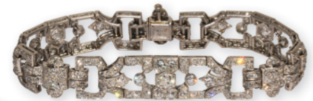
Hennell, Art Deco diamond and platinum bracelet, total diamond weight is approximately 11.75 cts.