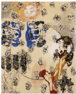
Ernest Briggs (American, 1923-1984), "Orbit," 1968, oil on canvas, 39" x 32"