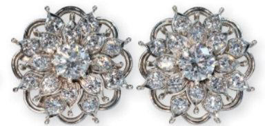
Pair of diamond and silver earrings and earring jackets, two round brilliant diamonds total approximately 1.78 cts.