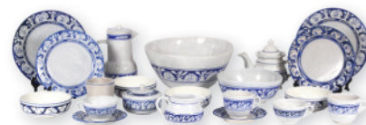
Collection of Dedham pottery