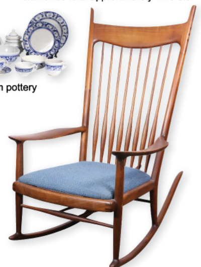
Important custom Sam Maloof (American, 1916-2009) walnut rocker, 1968