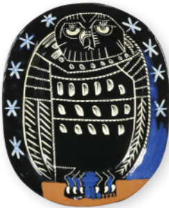
Pablo Picasso (Spanish, 1881-1973), "Hibou Brilliant," 1955, painted (glazed) ceramic plate, 15.2" h (one of two to be offered)