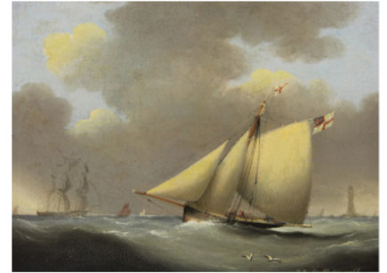
James Edward Buttersworth (American/British, 1817-1894), Ships Under Sail in Heavy Seas, pair of oils on panel, 6.5" x 8" (one shown)