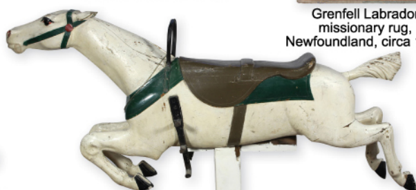
Prior and Church 'Derby' racer from Playland at the Beach, San Francisco, originally from Venice Beach Pier Amusement Park