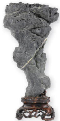
Chinese scholar's rock, 18" h