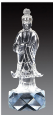
Chinese rock crystal carving of a beauty, 9.3" h