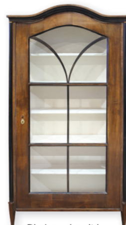
Biedermeier vitrine, circa 1820