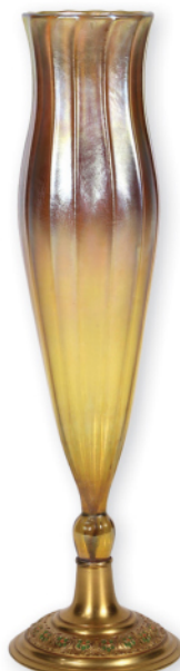
Selection of art glass including a Tiffany favrile vase New York gold New York gold