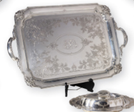
Gorham Renaissance style sterling silver tray and covered server, pattern number 5913A, each offered separately, largest: 162.82 troy ounces.