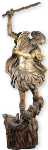
Monumental Continental carved wood Santos figure, second half 19th century, depicting Saint George slaying the dragon, 93" h