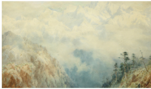
Sydney Mortimer Laurence (American, 1865-1940), Alaskan Mountain Vista, watercolor, 17.5" x 28.5"