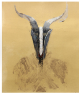
Nathan Oliveira (American, 1928-2010), "Figures Summer 1988 (#14)," 1988, monotype, 47" x 42"