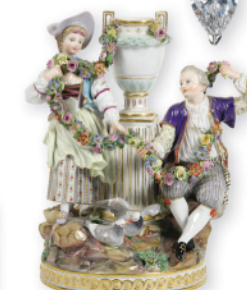
Collection of Continental porcelain including Meissen Provenance: Birmingham Museum of Art