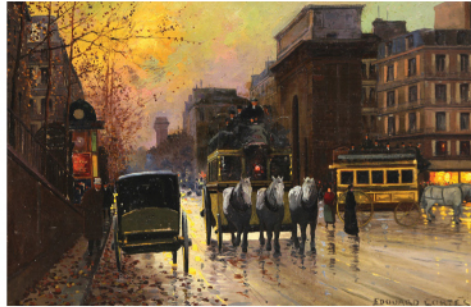
Edouard Cortes (French, 1882-1969), Parisian Street Scene with Figures, oil on canvas, 15" x 21.5" (one of two shown)