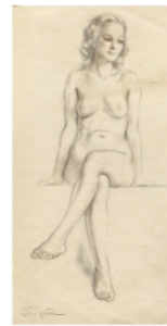
Leonard Tsuguharu Fougita (French/Japanese/Swiss, 1886-1968), Female Nude, charcoal on paper, 14" x 8.75"