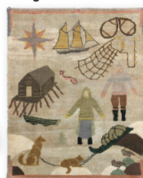
Grenfell Labrador missionary rug, Newfoundland, circa 1930