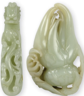
Collection of Chinese jades