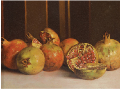
Emil Carlsen (American, 1848-1932), Still Life with Pomegranates, oil on panel, 10.5" x 13"