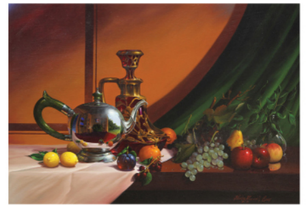
Stanley Brice (American b. 1936), Untitled (Still Life with Silver Teapot, Decanter, and Fruit), 1980, oil on canvas, 24" x 25"