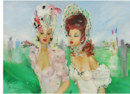
Jean Gabriel Domergue (French, 1889-1962), At the Races, oil on canvas, 19.25" x 25.5"