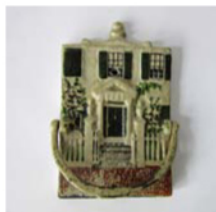
Lot 33. Sara Symonds knocker