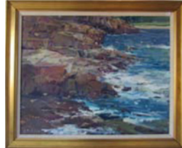
Lot 78. Dale Ratcliff