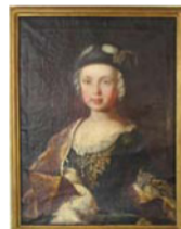
Lot 18. Early French portrait