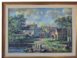
Lot 66. Stapleton Kearns