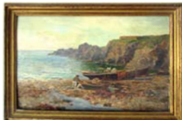
Lot 5. Continental oil