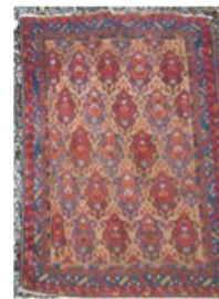
Lot 43. Afshar carpet