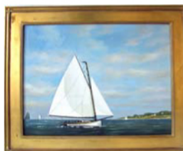
Lot 38. Vern Broe