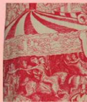
Carnival Print Dress