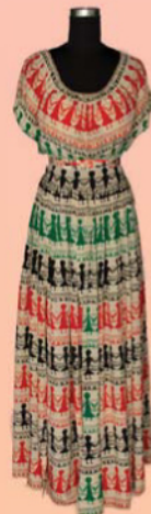
Adrian Paper Doll Print, 1948