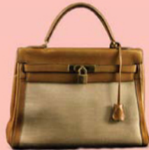
Hermes Kelly Bag