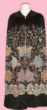
Beaded Opera Cape