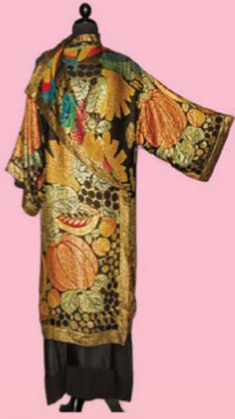
Lamé Fruit Coat