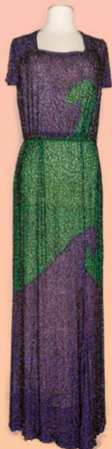
Beaded Gown, 1940s