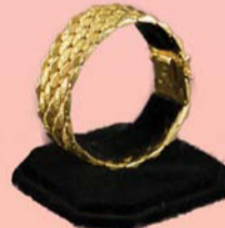
18k Serpent Bracelet