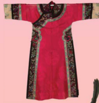
Chinese Gauze Robe