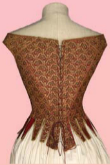
Brocade Stays, 18 th C