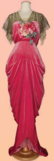
Hobble Skirt Gown, 1910