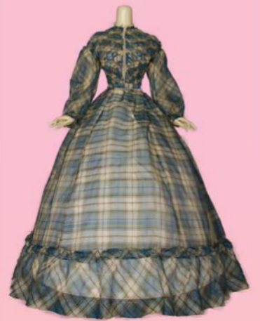
Civil War Dress