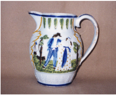
Pratt Jug with Sailors Farewell & Return ca 1820-30

5 Waugh Ave. Glyndon, MD 21136 410-833-0486