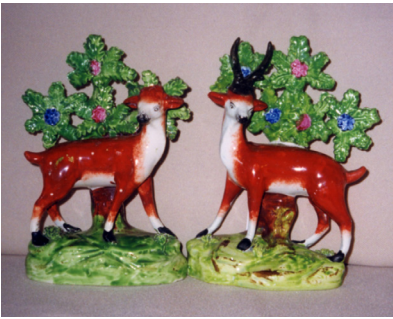
Bocage Pair of Red Deer ca 1810-20