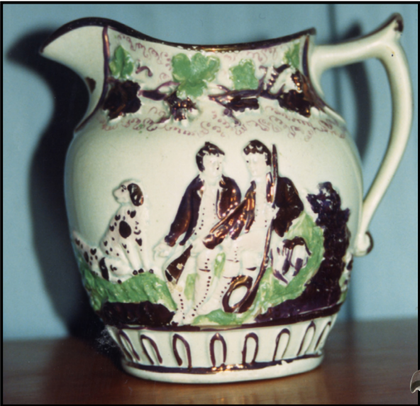
BILL SHAEFFER ANTIQUES, Glyndon, Md. — Pearlware hunt jug decorated in pink luster, circa 1810-20.