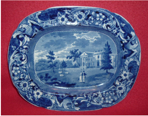
10¾" dark blue "Woodlands Near Philadelphia" platter by Joseph Stubbs. Fine condition - circa 1825.

5 Waugh Ave. Glyndon, MD 21136 410-833-0486