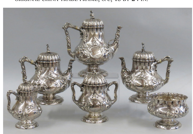
AMERICAN AND EUROPEAN SILVER Lot 350. 6-Piece Coin Silver Repousse Coffee and Tea Service R & W WILSON, PHILADELPHIA, 155 TROY OZ.