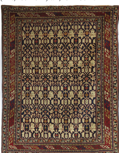
ORIENTAL CARPETS INCL. LOT 392. 19TH C. SHIRVAN WITH KONNEKEND DESIGN, 4' BY 5'