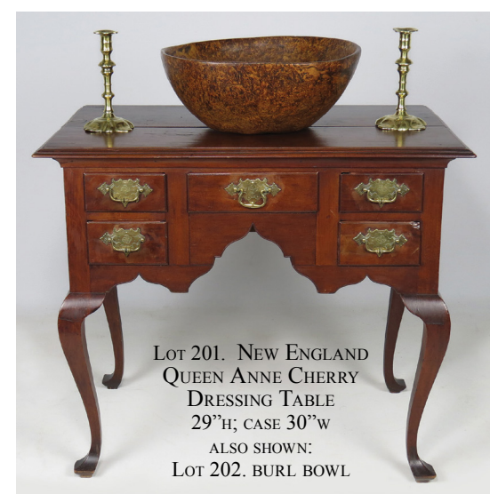
AMERICAN FURNITURE AND ACCESSORIES

Very limited preview morning of sale. ABSENTEE BID FORMS ARE AVAILABLE ON OUR WEBSITE: www.crnauctions.com