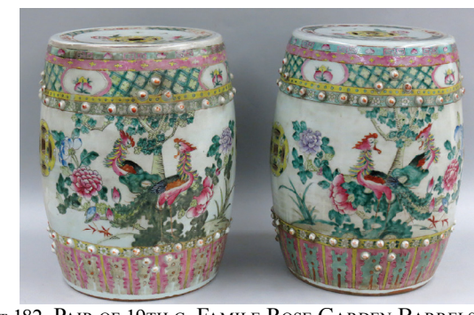
Lot 182. Pair of 19th c. Famile Rose Garden Barrels, 19"h