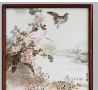
Lot 179. Pair. signed, 12 in. sq.