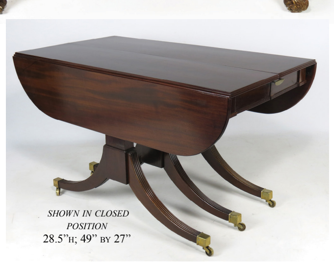
Lot 168. English Regency Mahogany Banquet Table WITH FOUR LEAVES, THE ACORDIAN MECHANISM FULLY EXTENDS TABLE TO 11 FT. 7 IN.