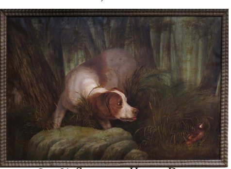
Lot 21. Southern Hound Dog