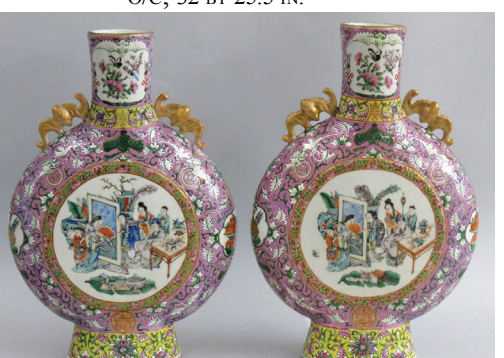
Lot 184. Large Pair of Chinese Export