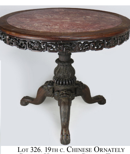
Lot 326. 19th c. Chinese Ornately Carved Hardwood Center Table WITH INSET MARBLE TOP, 38.5"DIAM.