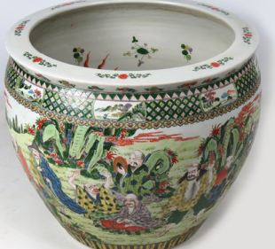
Lot 183. Large Famille Verte FISH BOWL W/ EIGHTEEN ARHAT DECORATION, 21"H; 24.5"D (RIGHT) LOT 175. TRIPLE PORTRAIT 40 BY 33 IN.