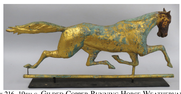
Lot 216. 19th c. Gilded Copper Running Horse Weathervane, 31"

Lot 148. English Queen Anne Gilt-Gesso Console Table, Early 18th C., 57.5"w