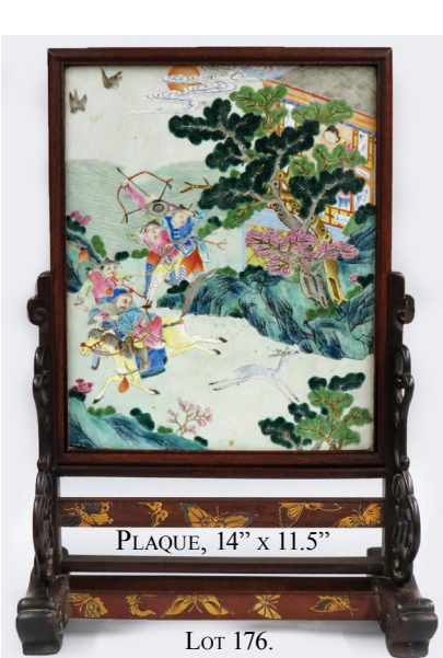
A PRIVATE COLLECTION OF CHINESE ANTIQUE ITEMS ACQUIRED DURING THE TRAVELS OF A GEORGIAN LADY IN THE 1950'S, AND DESCENDED THROUGH THE FAMILY.

ALSO SHOWN RIGHT, ANOTHER ENNEKING: LOT 2. SHEEP, O/C, 7 BY 8 IN.,