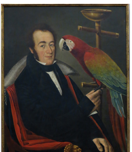
Lot 25. French or Spanish, c. 1830 GENTLEMAN WITH PARROT O/C, 32 BY 25.5 IN