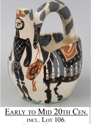
PABLO PICASSO CERAMIC JUG CAVALIER ET CHEVAL, 8"