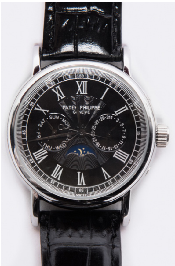
Patek Philippe No. 5052 Skeleton Back