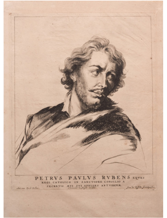
J. Visscher Etching Of Rubens