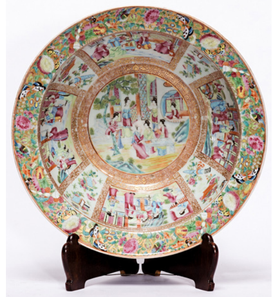
16 1/2 in. Rose Mandarin