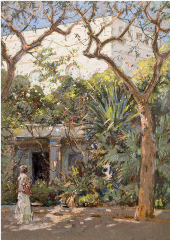
Abbott Thayer Pastel