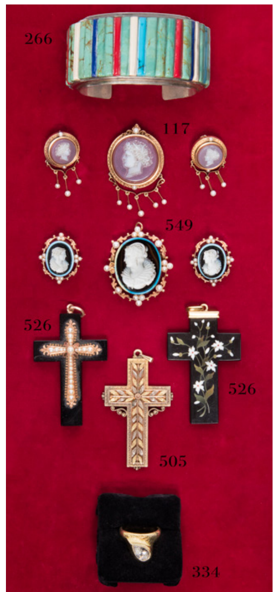
Large Selection Of Estate Jewelry