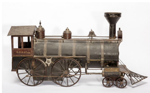
Tinmith Made Floor Train