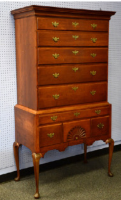
Cherry 2 piece Queen Anne high-boy, New England, c 1770-80