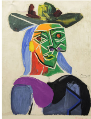
After Pablo Picasso, lithograph on BFK Rives wove paper, "Tete de Femme Au Chapeau", 31" x 21-1/2"