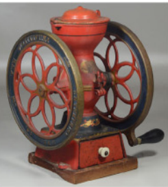
Enterprise No 1 cast iron coffee grinder, 12 1/4" h

Over 150 Lots of Fine Art & Works on Paper