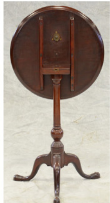
Mahogany dish top tilting candlestand with suppressed ball turning, 19" top, 18th c