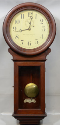
Chelsea No 2 weight driven wall regulator, dial marked G. S. Lovell Clock Co, Philadelphia