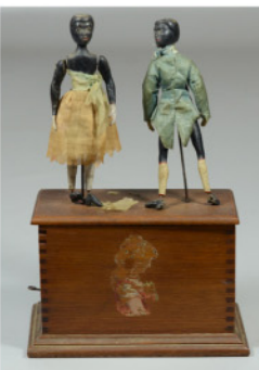
Clockwork "2 Jiggers Dancing" on box dovetailed mahogany case, retains partial label, 10" high