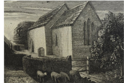
Graham Sutherland (English, 1903-1980), etching, "The Meadow Chapel", 1928