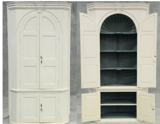
One-piece pine barrel-back corner cupboard, American, third quarter 18th C