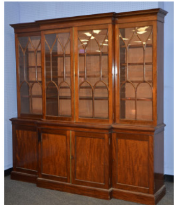
5-Part American Federal mahogany break-front, early 19th C, 84" w x 98-1/2" h