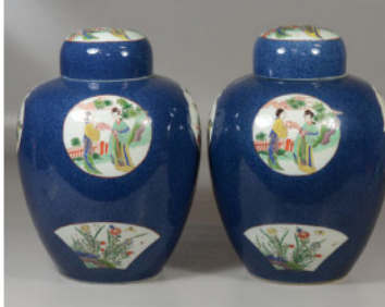
Pair of Chinese powdered blue ginger jars, "1000 antiques" Famille Vert reserves, 13 1/2" h