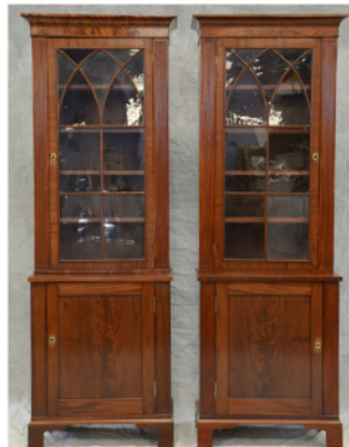
Pair of mahogany Georgian style two-piece display cabinets, 88" h