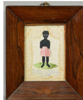
Cut paper silhouette of young African American Girl, 7-3/8" x 6" overall, in rosewood veneer frame, c 1840-60