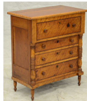
Figured maple child's size Sheraton chest, 21" wid