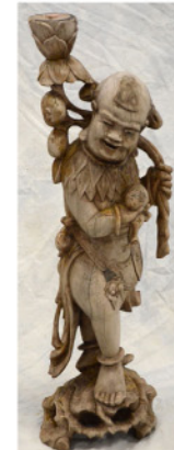
Carved hardwood Chinese figure of a man carrying fruit, 26 3/4" h