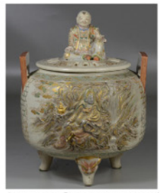
Japanese Satsuma covered potpourri jar, 13" high