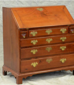
Chester County Walnut Queen Anne slant front desk, 37" w