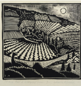
Wharton Esherick, woodcut, "Solomon had a Vineyard", 1 of 3