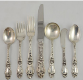
57 pcs Whiting Lily pattern flatware, 68.56TO