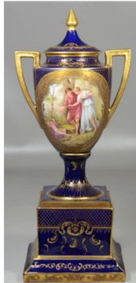
Royal Vienna porcelain lidded urn, cobalt and gilt decorated, "Cupid & Cephisia", 19 1/2" high