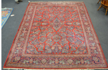
9x12 Sarouk from approx. 40 oriental carpets