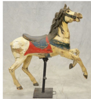
Dentzel prancer carousel horse, on metal stand