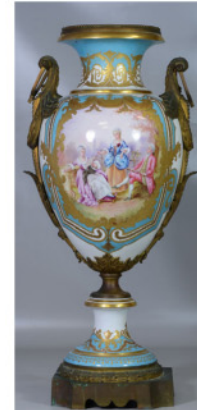
Gilt bronze mounted Sevres style porcelain 2 part urn, artist signed "Guilleman", 23" tall, late 19th c