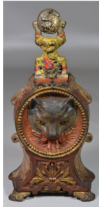
J & E Stevens cast iron Cat and Mouse mechanical bank