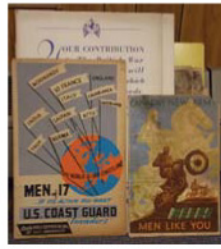
Museum De-Commissioned War Effort Posters