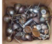
Over 200 Box Lots at 5 pm