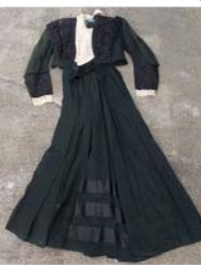
Many Lots Vintage Clothing

Furniture/Accessories : c.1890 Hubbard bench, set of 5 leather dining chairs w/dog head carving, oak 2 door bookcase, c.1910 carved claw footed upholstered armchair, Hamilton oak 6 drawer industrial cabinet, hexagon table w/carved base, Savonarola chair, 19 th .c. Oriental urn stands, mid-century modern pamphlet stand, 3 seat bench w/cane back & barley twist, tall mirrored back server, mahogany marble top table, round walnut table with lion face and paw feet, 19 th .c. poster bed, Bible stand, candelabras, antique wall sconces, bulls eye mirrors, Art Deco smoking stand, Victorian upholstered courting sofa, German deco inlaid table, Victorian floor lamps, stained glass windows, solid brass horn chandelier, mid-century modern lamps & shades,