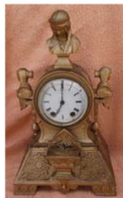
25 Antique Clocks

The Varnum Armory, 6 Main Street, East Greenwich, R.I.