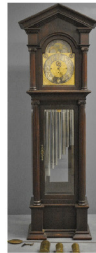
by Elliott, London