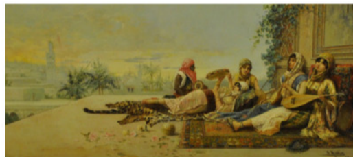
probably Antonio Munoz Degrain