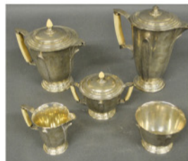
Reed and Barton