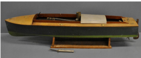
H.E. Boucher Live Steam