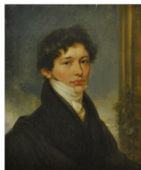
Very fine oil on canvas attributed to Peale Family