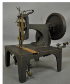
Rare Singer Sewing Machine #1