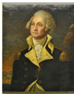
Oil on canvas of General George Washington