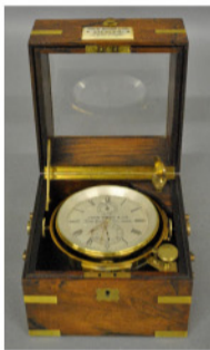
John Bliss & Co.