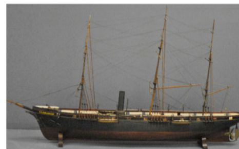
Fine "Live Steam" 8' Model of the steam Sloop-of-War "U.S.S. Kearsarge"