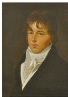
English Sea Captain