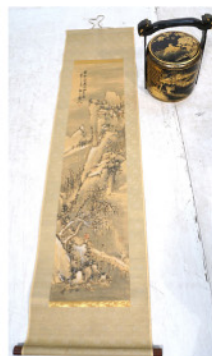
Chinese and Asian