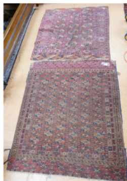
Estate Oriental Carpets