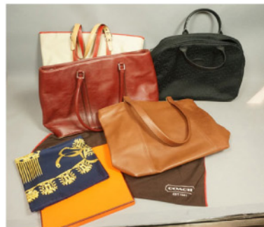
Hermes and Coach