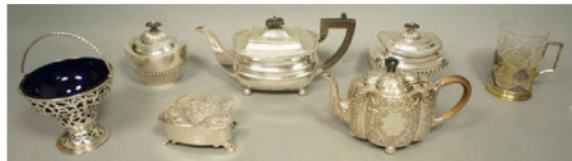
Many lots of Antique Sterling