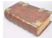
Leather Bound Books