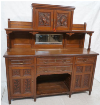
Victorian Hunt board