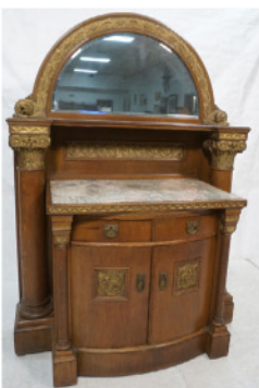
Deco Oak Marble top