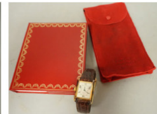
Cartier and lots of Estate Jewelry