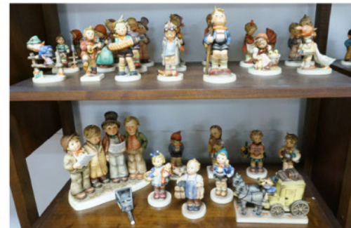
Collection of Large Hummels