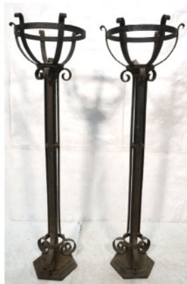
Deco Iron Torchiers