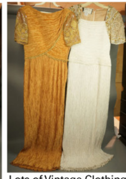
Lots of Vintage Clothing and Couture

10AM: Uncatalogued estate items, (Selling from 10 AM til past 5PM) collectibles, household items, glassware, china, table and box lots from local estates. Lots of Estate art, Sports Collectible, Books. See the pictures on our website