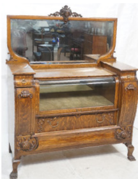
Figural carved Oak