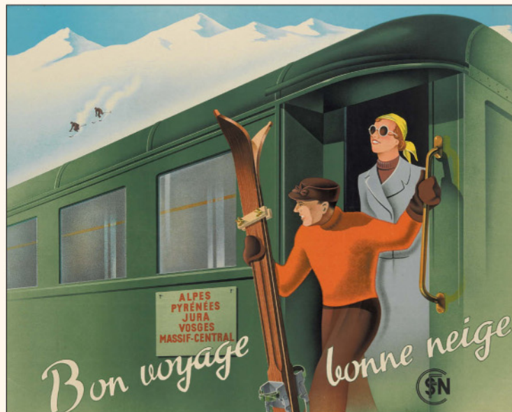
Pierre Fix-Masseau, Bon Voyage / Bonne Neige , 1938. Estimate $3,000 to $4,000.