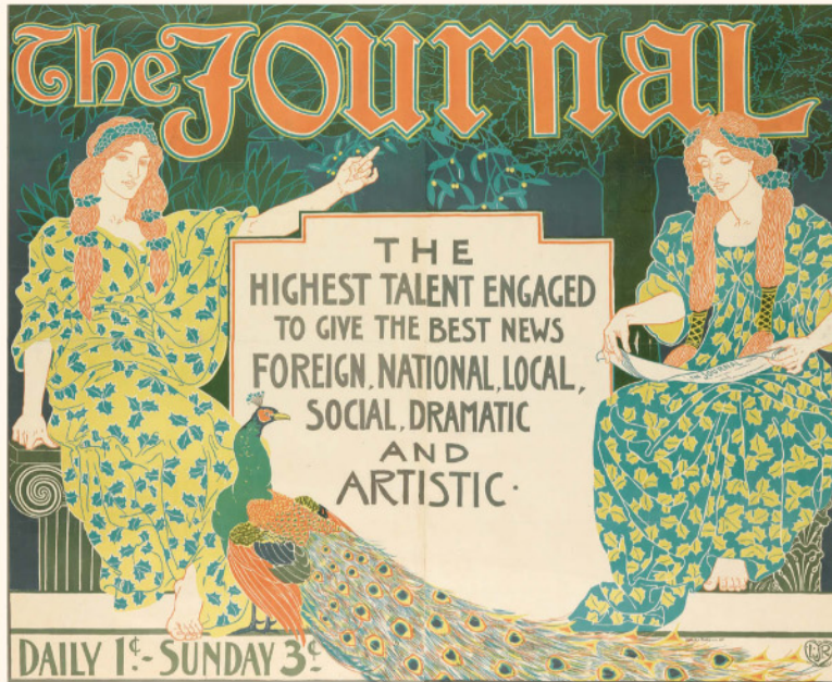
Louis J. Rhead, The Journal , 1896. Estimate $2,000 to $3,000.