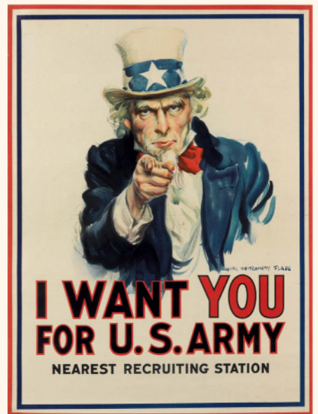
James Montgomery Flagg, I Want You For U.S. Army , 1917. Estimate $8,000 to $12,000.