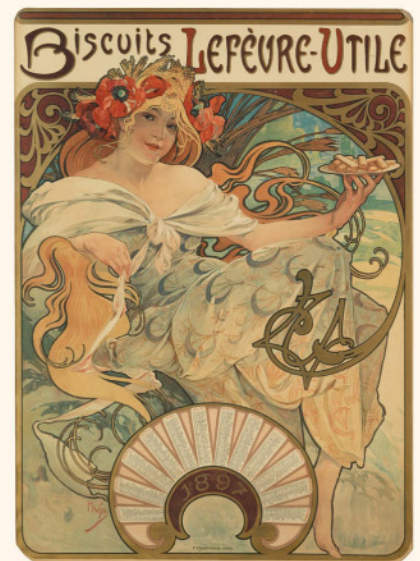
Alphonse Mucha, Biscuits Lefèvre-Utile , 1897. Estimate $4,000 to $6,000.