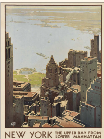
Leslie Ragan, New York / The Upper Bay From Lower Manhattan , 1935. Estimate $6,000 to $9,000.