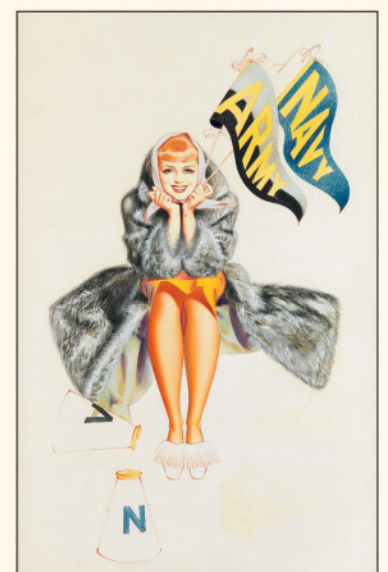
George Petty, Army vs Navy , watercolor and gouache on board, for Old Gold Cigarettes, 1940. Estimate $7,000 to $10,000.