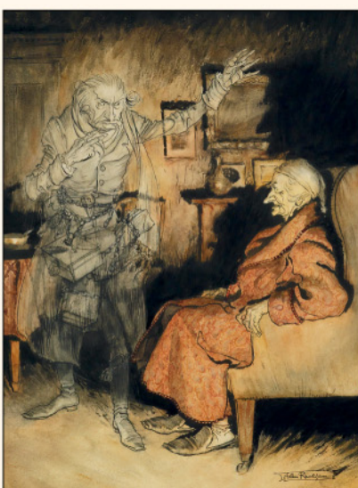
Arthur Rackham, Scrooge and the Ghost of Marley , pen, ink and watercolor, from Dickens's A Christmas Carol . Estimate $40,000 to $60,000.