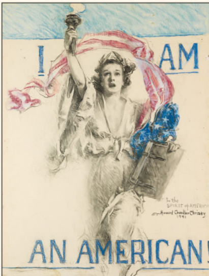
Howard Chandler Christy, I Am An American! , charcoal and pastel on board, 1941. Estimate $25,000 to $35,000.