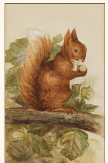
Beatrix Potter, Squirrel Nutkin , watercolor with pencil. Estimate $30,000 to $40,000.