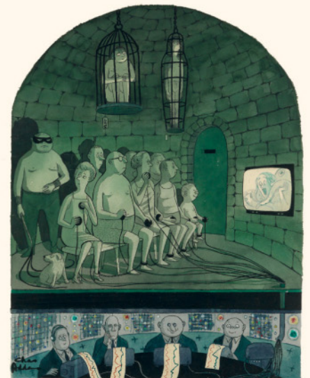
Charles Addams, Show Magazine cover illustration , mixed media, 1960s. Estimate $6,000 to $9,000.