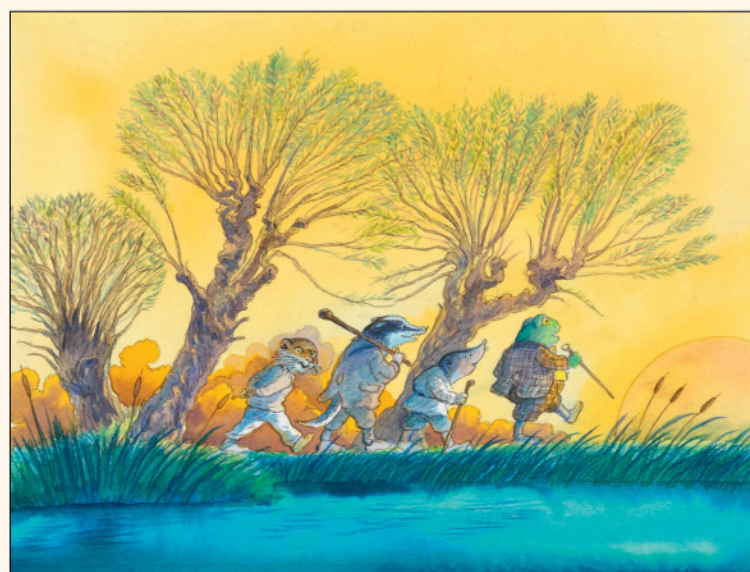
Michael Foreman, Into the Sunset , watercolor, pen, ink and pastel, for cover of 2001 edition of The Wind in the Willows . Estimate $2,500 to $3,500.