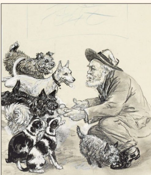
Diana Thorne, Dogs & More Dogs , two mixed media illustrations with ink, chalk and wash for Earl Marvin's Nothing But Dogs , 1947. Estimate $1,000 to $1,500.