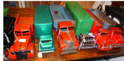
Wyandotte, Chein, Buddy L trucks