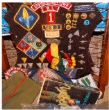
good selection of Boy Scout lots

DIRECTIONS: FROM CT: take 95 north to exit 5A (102 S). follow 102 S, cross over Rt 3 and continue on 102 for approx 9 mi. Temple is on left. FROM MASS: take 95 south to exit 9 (Rt 4), follow Rt 4 to exit 5B (102 N). stay on 102 for ¼ mile. Temple is on right.