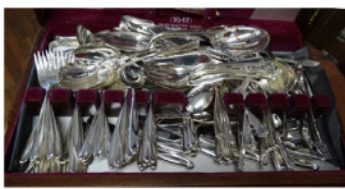
121 pc sterling flatware set