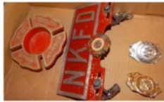
items from North Kingstown Fire Dept

FURNITURE/RUGS: excellent oak Hoosier; period Hepplewhite bureau; period highboy base; Pembroke table; period corner cupboard; 2, one-door cupboards; pine commode; mahg claw foot bureau; drop leaf table; wooden sea chest; oak drop leaf table; porcelain top table and 4 chairs; 3pc mahg bedroom set; Tramp Art inlaid stand; hanging corner cupboard; Gustave Stickley desk (no leather on top); Industrial desk with map; 3 small Oriental rugs