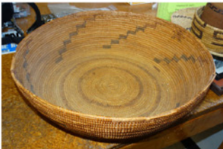
large Indian basket