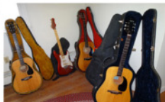
over 30 guitars