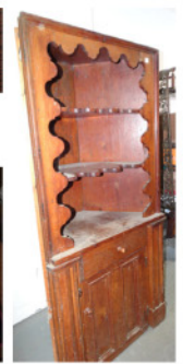
period corner cupboard