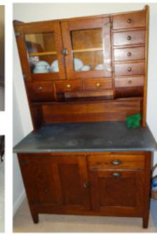
oak Hoosier in nice condition