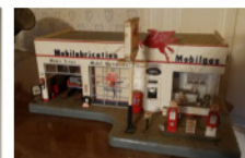
toy Mobil gas station