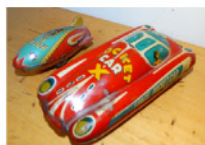
2 Modern Toy rocket cars