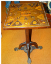
Tramp Art inlaid stand