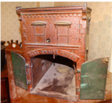
Fire Engine House vintage