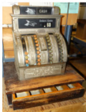
National brass cash register