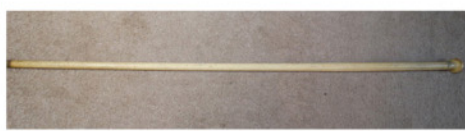
whale bone cane