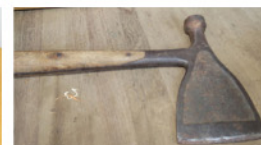
H. D. Smith Perfect Handle hatchet