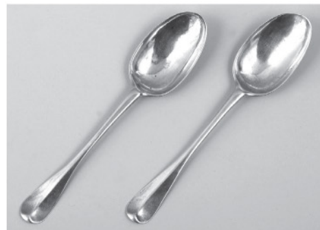
Elias Pelletreau (Southampton, NY) table spoons, mid 18C, 8"l. Prov.: descendant Thomas Halsey.