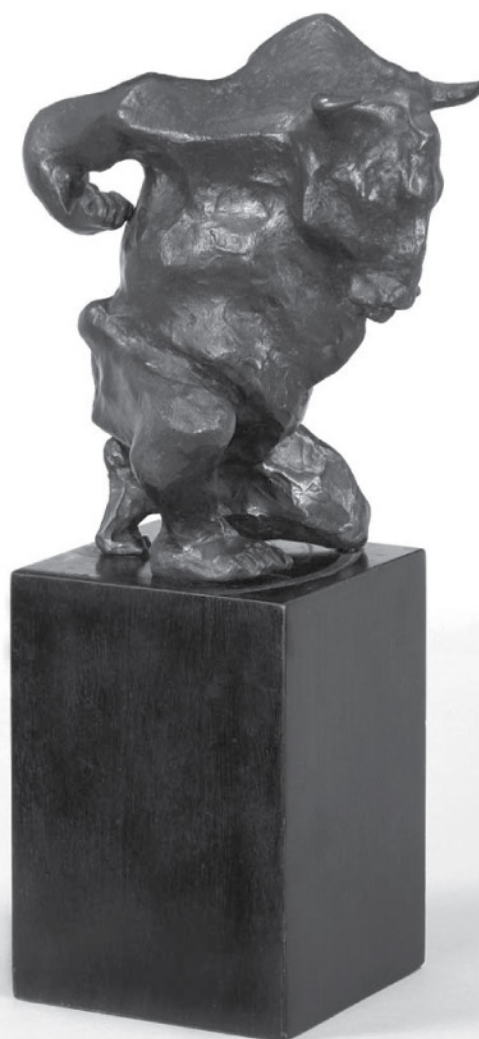
MICHAEL AYRTON (British, 1921-1975), bronze, 6-1/2"h, 4-1/4"w.