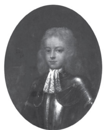
Portrait of young boy in armour (British School, early 18th century), oil on oval canvas, 26-1/4"h, 20-3/4"w.