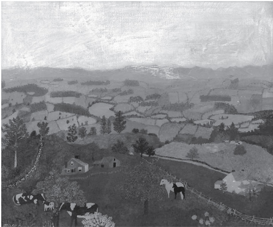
GRANDMA (ANNA ROBERTSON) MOSES (American, 1860-1961), "Upper Cambridge Valley", tempera on masonite, original Grandma Moses label, 19-1/2"h, 23-1/2"w.

Fully illustrated on-line catalog: www.southbayauctions.com