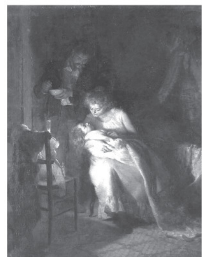
EDMOND ALPHONSE DEFONTE (French, b.1862), oil on canvas, 46"h, 35"w.