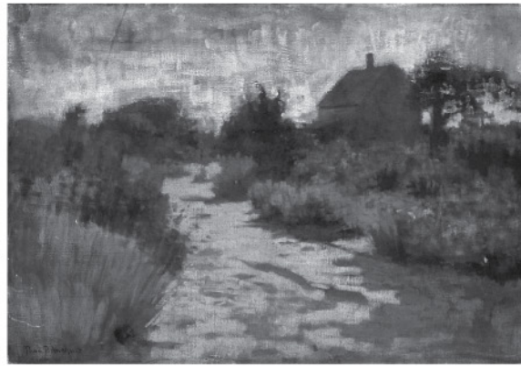
THOMAS P. ANSHUTZ (American, 1851-1912), oil on canvas, 16"h, 23"w.