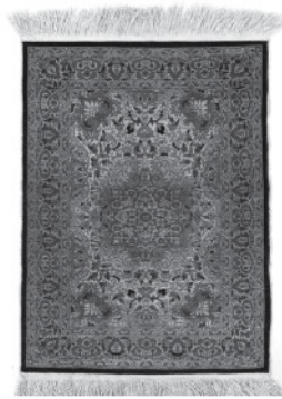
Hereke Oriental silk rug, 3'6"l, 2'5"w.