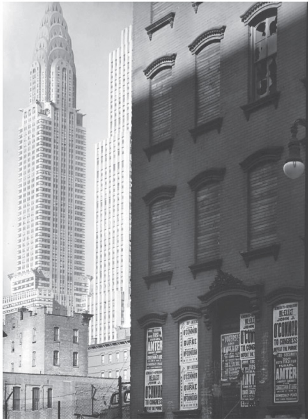
Collection BERENICE ABBOTT (American, 1898-1991), "Federal Art Project 'Changing New York'" stamp, gelatin silver prints, 10"h, 8"w.