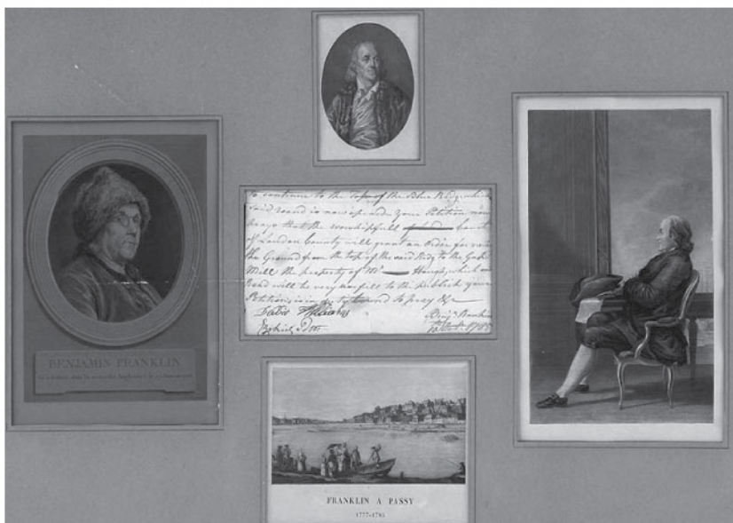
Benjamin Franklin letter signed "Benja Franklin", dated 10th Oct, 1785, letter 4-1/2"h, 7-1/4"w.