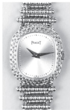
Piaget 18k gold ladies bracelet watch.