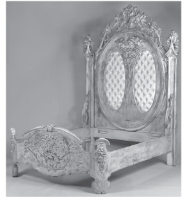
Victorian mahogany Lincoln bed, 107"h, 71"w, 86"d