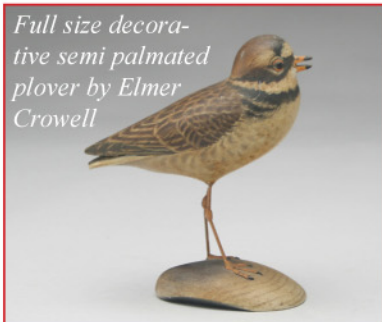
Full size decorative semi palmated plover by Elmer Crowell