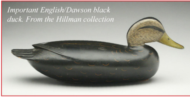
Important English/Dawson black duck. From the Hillman collection