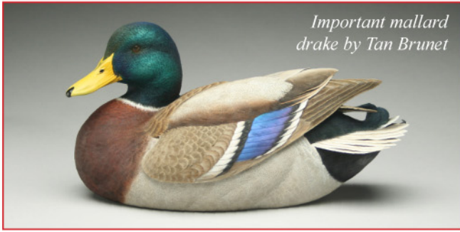
Important mallard drake by Tan Brunet

THE LEADING AND MOST TRUSTED DECOY AUCTION FIRM IN THE WORLD GUARANTEED CONDITION REPORTS | BUYER'S PREMIUM STILL 15%