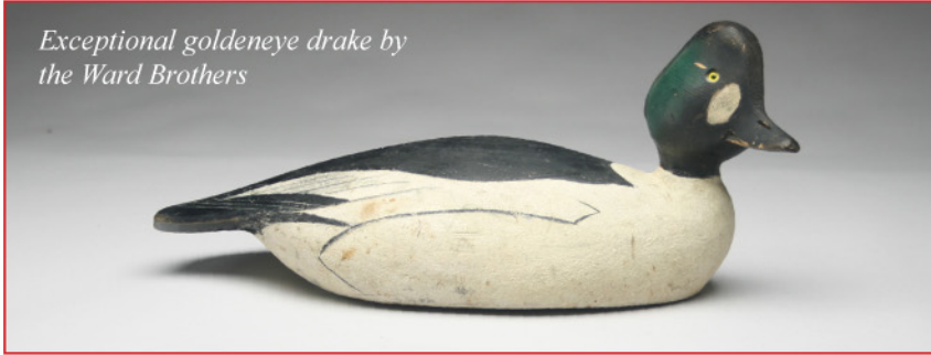
Exceptional goldeneye drake by the Ward Brothers