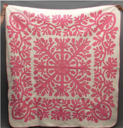
OVER 25 QUILTS