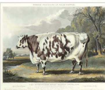
Fores Cattle Print