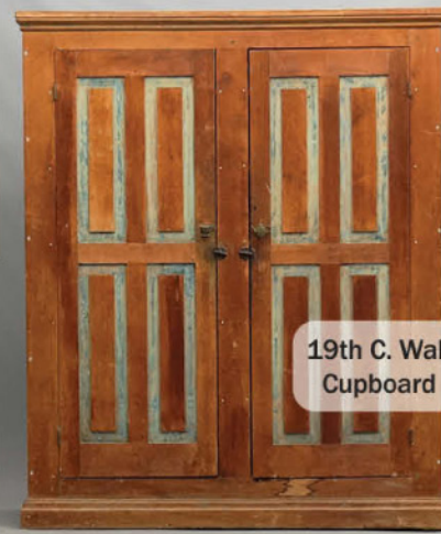
19th C. Wall Cupboard