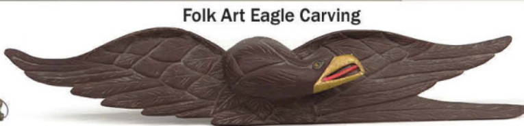
Folk Art Eagle Carving