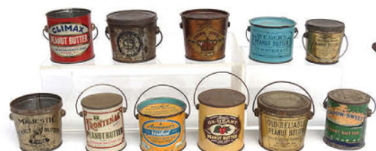
Peanut Butter Tins