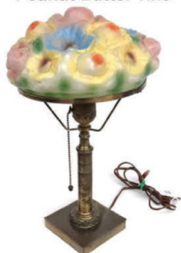
Pairpoint Puffy Lamp