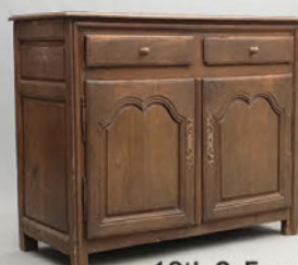
19th C. French