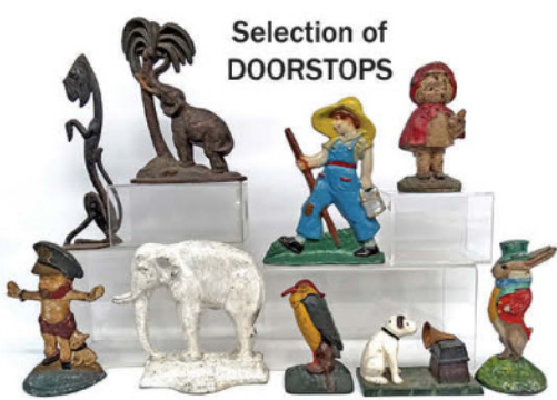
Selection of DOORSTOPS