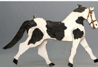
Folk Art Horse Signs 62" L.