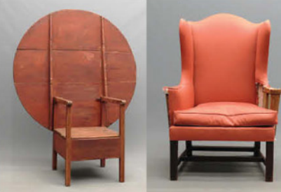
18th & 19th C. FURNITURE