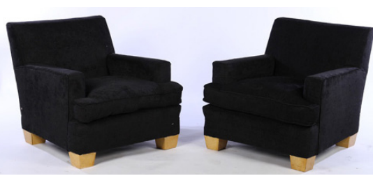
Manner of Jean Michel Frank