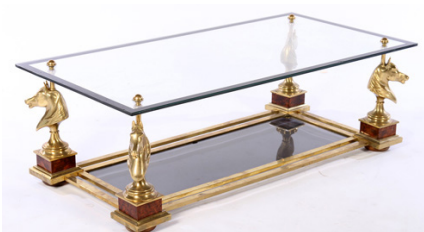
Maison Charles Coffee Table