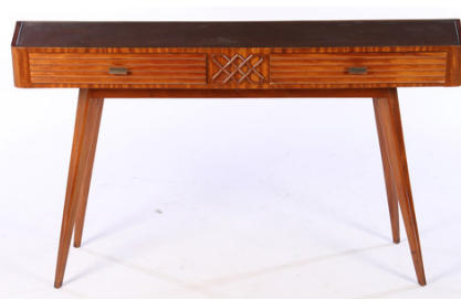
Attributed to Gio Ponti