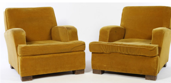
Manner of Jacques Adnet