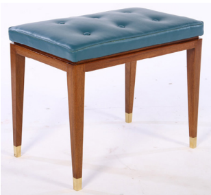
Pair Stools Attributed to Gio Ponti