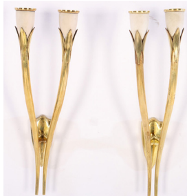
Pair Attributed to Gio Ponti