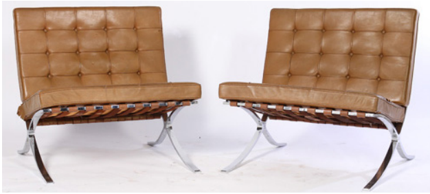
Pair Ludwig Miles Van Der Rohe