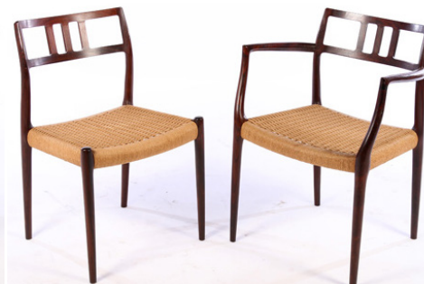
Set of 6 Rosewood Niels O Moller