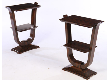
Art Deco Macassar Tables