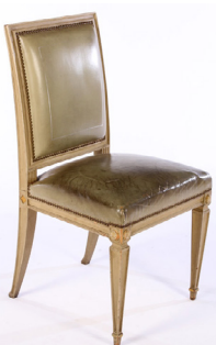
Jansen Set of 6