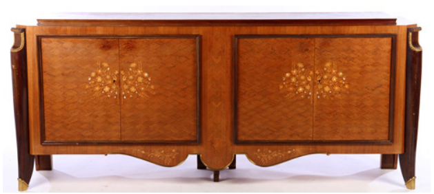
Attributed to Jules Leleu