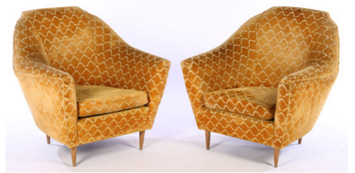
Attributed to Ico Parisi