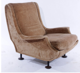
Pair Marco Zanuso Regent Lounge Chairs