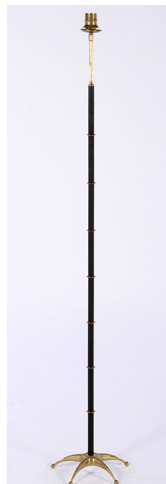
Attributed to Jacques Adnet