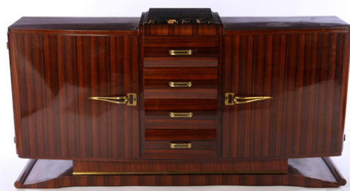
Art Deco Macassar Sideboard