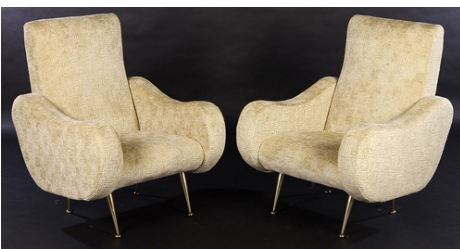
Restored Marco Zanuso Chairs