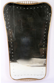
57 Inch Brass Mirror