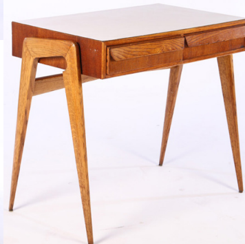
Attributed to Gio Ponti