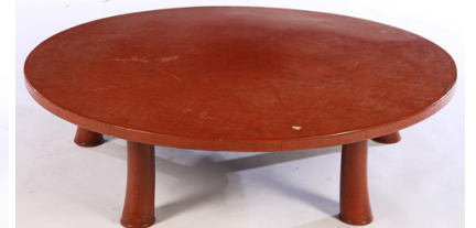
5 Leg Possibly Gibbings

PREVIEW: JANUARY 27 - 29 from 10AM - 5PM Lic.AH001803