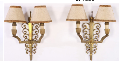
4 Bronze Poillerat Sconces