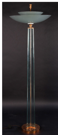
Fontana Arte Floor Lamp