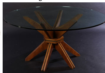
62 Inch Glass Top