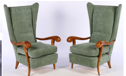
Restored Pair Attributed to Paolo Buffa