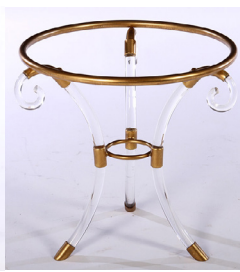
Pair of Lucite Gueridons