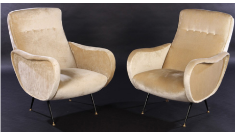
Pair Restored Marco Zanuso Chairs