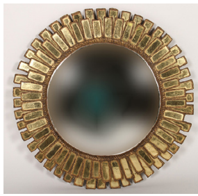
Manner of Line Vautrin