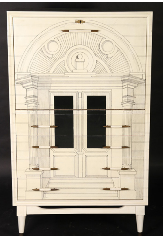
Fornasetti Style Bar Cabinet