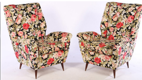
Pair Gio Ponti