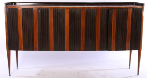
Paolo Buffa Sideboard