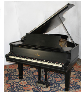
Steinway & Sons Model B C. 1886