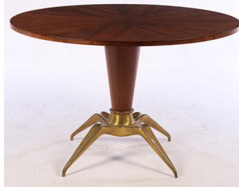
Mahogany and Bronze