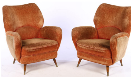
Pair Italian 1950