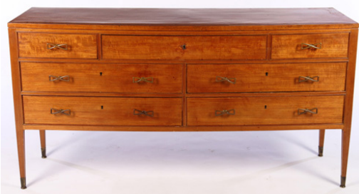
Paolo Buffa Commode

SATURDAY JANUARY 30 TH , 2016 starting at 10AM