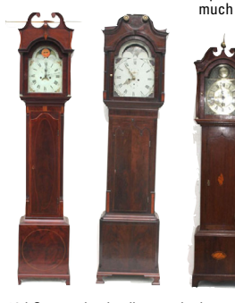
19thC carved oak tall case clock w conch shell inlays marked Cotton & Reeve - London - 84" tall; Fine 18thC Chippendale period mahog grandfather's clock featur-ing moon phase dial, fluted quarter col-umns & fine inlay w NY label on interior -96" tall: Fine carved mahog inlaid grandfather clock w moon phase calen-