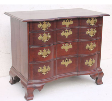
Important period Chippendale ca 1780 Boston mahog 4 dr graduated block front chest w outstanding over hanging molded top above a conforming shaped cock beaded case on onee bracket base - orig brasses &

scape w brook, farmhouse & cows - possibly by