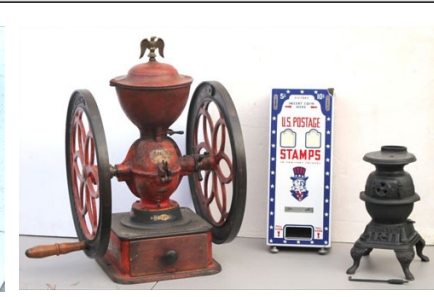
ca 1880 "Philadelphia Enterprise Mfg" coffee grinder in old red w decals; ca 1930's "Victory" white porcelain enamel paint dec stamp dispensing machine & a Rare late 19thC/ turn of the century American cast iron pot belly stove salesman sample marked "Spark"... See our internet sites for