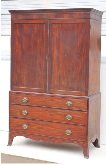
Important & rare period Hepplewhite ca 1790 inlaid mahog Boston linen press attrib to John & Thomas Seymour - 78" tall x 49" wide x 22 1/2" deep... Seymour characteristics incluse of blue cartridge paper drawer lining, tri lobed apron w high flared feet & hidden trap door in the top - fine unrestored