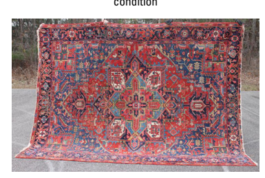
8'3"x10'8" antique Persian Heriz Oriental rm size rug - One of 30+ fine Oriental Rugs in this sale

19thC 22"x36" o/c New England (probably NH) land-