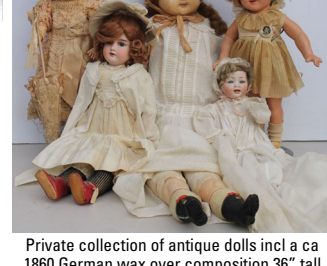
1860 German wax over composition 36" tall doll w blown glass eyes & a ca 1930's/40's Ideal Shirley Temple 18" composition doll in all original condition incl clothing & pin; etc many more dolls