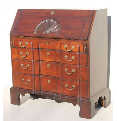
Period Chippendale ca 1775 CT River Valley cherry hell carved block front slant III desk w special conch shell inlaid interior prospect drawer, orig shell carved block front slant lid desk w spectacular orasses, locks & keys - believed to be either Hartford CT or Northampton, MA... There are 4 outstanding period block front pcs in this sale.