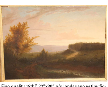
Fine quality 19thC 22"x30" o/c landscape w tiny figures & village in background depicting mountains & a meandering stream (thought to be the Swift River from a New Salem, MA home) (indistinct faded chalk signature & other writing on verso)