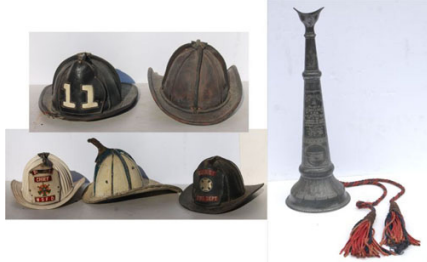
Lot of 5 antique fire helmets - 1 marked West Springfield, 1 marked Quincy plus a dated August 8, 1907 presentation silver plate fire trumpet w engraved dec referencing Holyoke & Westfield MA - 20" tall - Provenance: collection of a former West Springfield Fire Chief