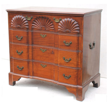
Extremely rare & important QA ca 1755 highest quality carved Cuban mahog Newport, RI 3 shell block front 4 drawer chest w orig brasses, locks, base, one board top & sides - 39 1/4" case width suggests that this impressive chest is the progenitor of the smaller 3 shell block fronts to follow - As powerful a chest as we've ever handled!