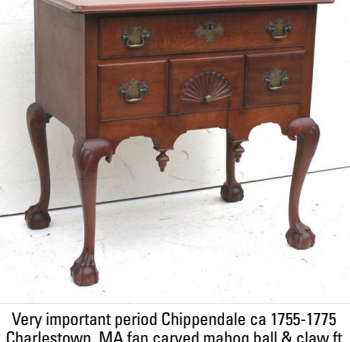
Charlestown, MA fan carved mahog ball & claw ft dressing table (lowboy) featuring orig molded top w invected corners plus shell carved knees -(one of the 3 best lowboys we've ever sold) - 27 1/4" case width