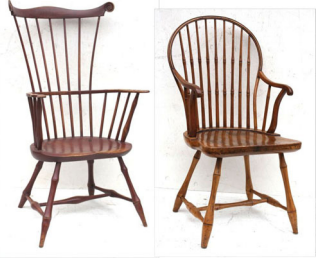
ca 1780 PA fan back armchair w volute carved ears in old worn reddish brown paint & a ca 1790 fine Tracy School CT sack back armchair w bulbous turnings & unusually tall back -See our internet sites for more Windsor chairs