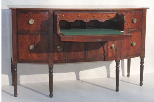
Rare period Sheraton ca 1820 Middletown, CT mahog bowfront butler board w desk interior & inlay & cross banding 40 1/4" tall x 67" wide x 25 3/4" deep