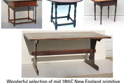
Wonderful selection of mid 18thC New England primitive tables from Wm & Mary to QA incl trestle, tea & tavern forms... See our internet sites for full details