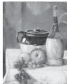
STILL LIFE BY WILLIAM JAMES GLACKENS (AMERICAN, 1870-1938)