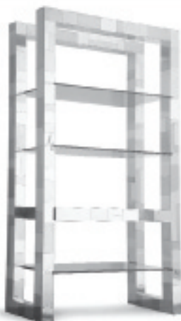
CITYSCAPE WALL UNIT BY PAUL EVANS

CONTINENTAL AND AMERICAN FURNITURE & DECORATIVE ARTS, FINE ART AND ASIAN ART