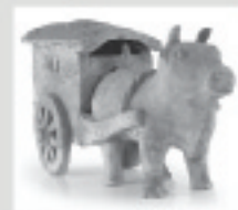
CHINESE PAINTED EARTHENWARE OX AND CART.