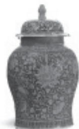
CHINESE EXPORT FAMILLE NOIRE COVERED JAR