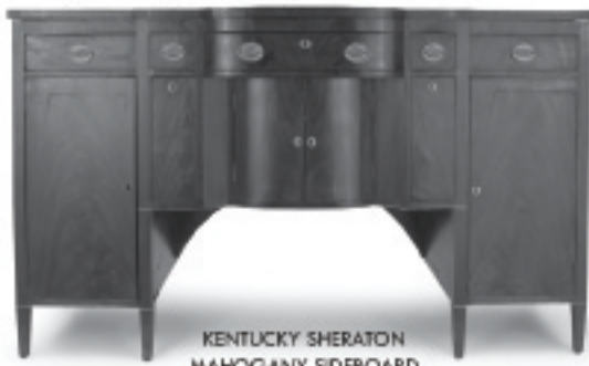
KENTUCKY SHERATON MAHOGANY SIDEBOARD

LOCATION: CWE GALLERY 4739 MCPHERSON AVE. ST. LOUIS, MO 63108