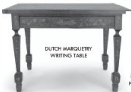
DUTCH MARQUETRY WRITING TABLE