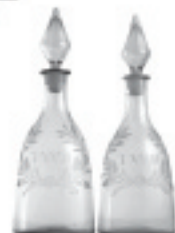
PAIR OF CHARLESTON GLASS DECANTERS