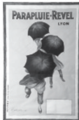
PARAPLUIE REVEL LITHOGRAPH BY LEONETTO CAPPIELLO (ITALIAN, 1875-1942), 129" h.