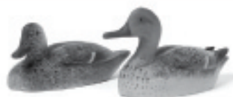
PAIR OF GREEN WING TEAL BY DON GEARHART