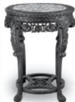
GING-CARVED TABLE WITH PORCELAIN MEDALLION.