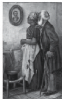
CONTEMPLATING LINCOLN BY HARRY ROSELAND (AMERICAN, 1866/68-1950)