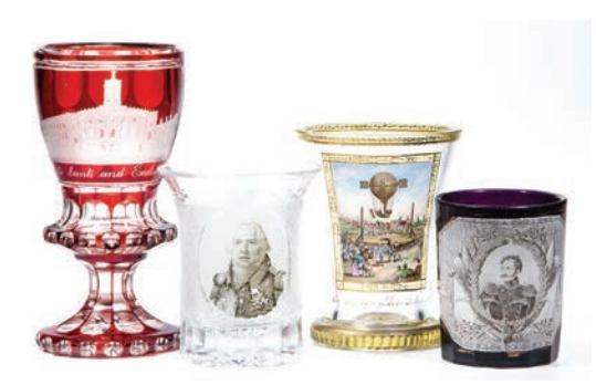
Rare historical vessels including a Girard's Bank & Exchange, Philadelphia goblet from the Stout collection