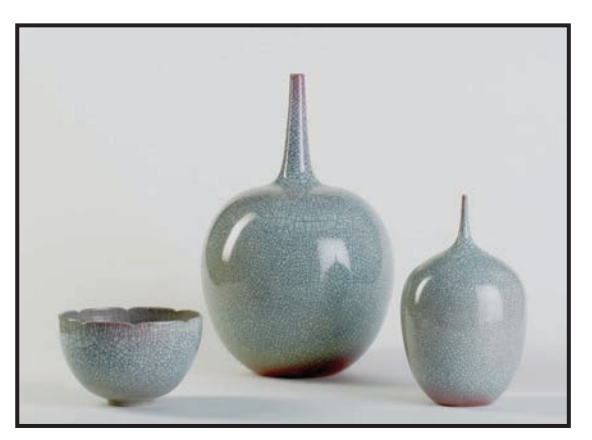
CLIFF LEE GALLERY & STUDIO, Stevens, Penn. — Kuan ware crackle glaze vessels.

Incorporating the techniques and aesthetics of the 18th century in the creation of 21st century decorative porcelain objets d'art