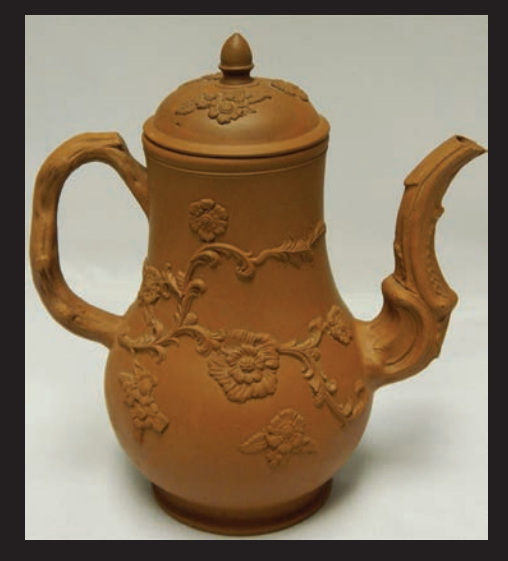
English Redware Silver form Chocolate Pot with beautifully applied foliate sprigging and a bold crabstock handle and spout, c. 1750-70, ex Root Collection.