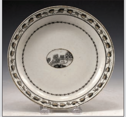
7 1/2" Mt. Vernon Saucer Dish