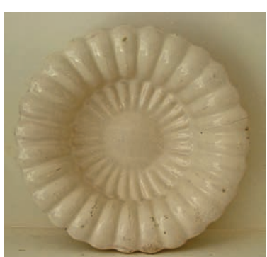
17th c. Delft white Gadrooned dish