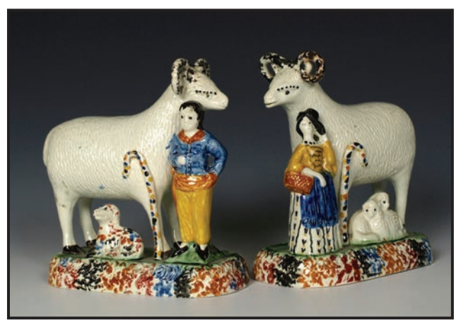
POLKA DOT ANTIQUES, South Salem, N.Y. — Pair of Prattware rams with shepherd and shepherdess, circa 1800–20, with a dog and two sheep, 6½ inches high.