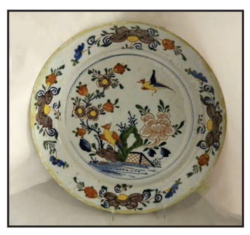
MARIA & PETER WARREN ANTIQUES, Wilton, Conn. — London Delft 13¼-inch polychrome charger, circa 1770–80, brightly painted in green, iron red, yellow and manganese purple, depicting a bird flying over another in a fenced flower garden, the rim with four floral sprays.