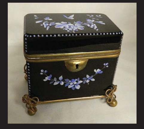
Rare Moser Blue crystal Box - lovely gilt mounts with raised enamel leaf and grape decoration, c. 1880. (5")