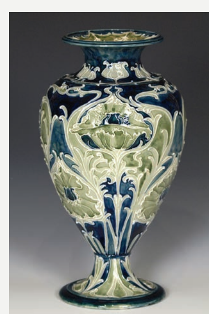
Moorcroft McIntyre 'Florian Ware' Poppy Vase, 1890's, printed and painted factory marks, 12".