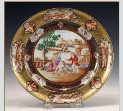
Palaceware Plate with Rare Furopean Scene