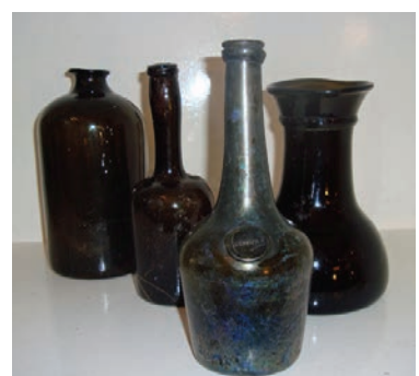
Winebottles 18th cent.