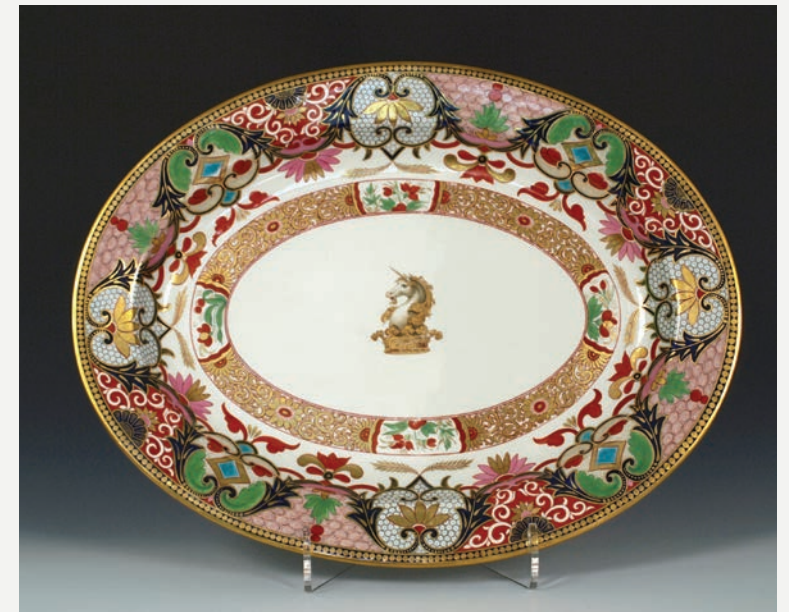
Flight, Barr & Barr Worcester Crested 'Japan Pattern' Part Dinner Service, 1815/20, with a unicorn head on ducal coronet, impressed and printed factory marks. Largest platter 22". (42 pieces)