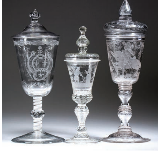
Covered pokals from the Stout collection

See our website for more details and preview photos.