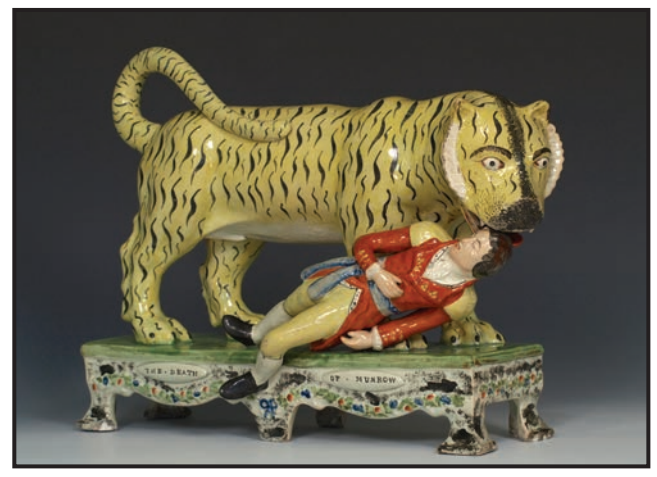
POLKA DOT ANTIQUES, South Salem, N.Y. — Rare Staffordshire pearlware group, "The Death of Munrow," circa 1820–30, modeled as a large tiger attacking the stricken Lieutenant Munrow, on rectangular base with bracket feet, the title impressed on two oval plaques, 14½ inches long.