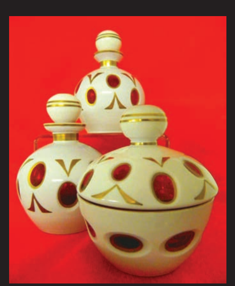
Set of Three French Cosmetic Bottles, Overlay White on Red Crystal c1910 One for Powder and 2 Perfumes All in Wonderful Condition