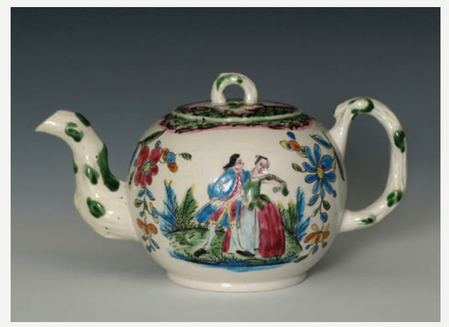
Staffordshire Salt-Glazed Stoneware Teapot and Cover, c.1760, polychrome enameled with lovers and a flute player, 4".