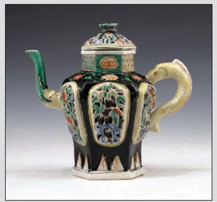
Kangxi Famille Noire Teapot