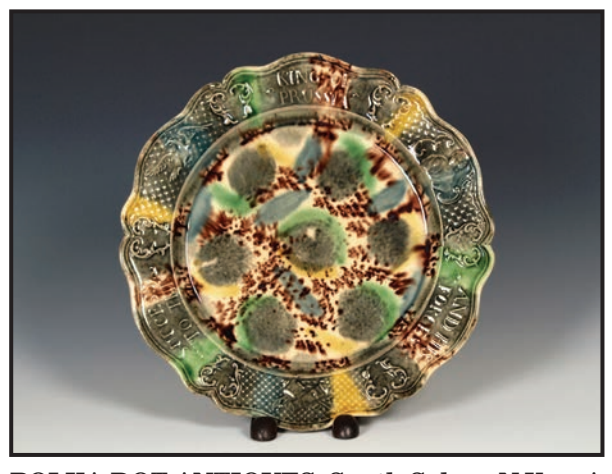
POLKA DOT ANTIQUES, South Salem, N.Y. — A Staffordshire tortoiseshell creamware King of Prussia plate, 1756–63, molded in low-relief with "Success to the King of Prussia and His Forces," alternating with the bust of the King of Prussia, an eagle, drum, cannon and a flag. It measures 9½ inches in diameter.