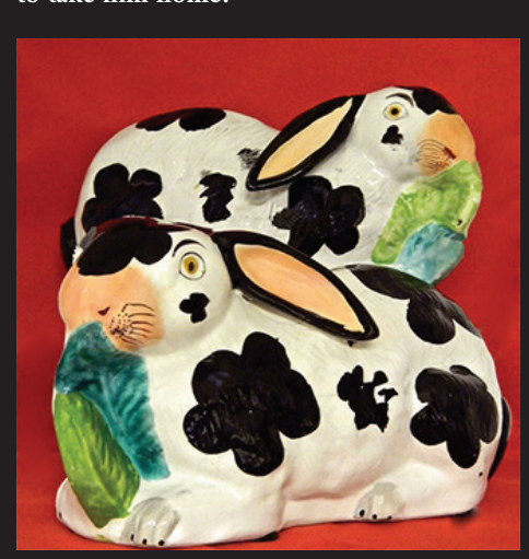
A wonderful pair of English Staffordshire Bunnies decorated with the clover leaf design and eating cabbage leaves, c. 1860-70.