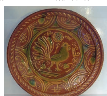
Large rare Dutch slipware Charger ± 1620