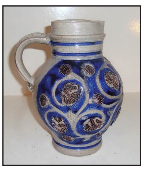
ANTIQUES LEON-PAUL van GEEN-EN, The Netherlands — Seventeenth Century German stoneware Westerwald jug.