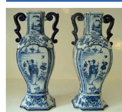
18th c. pair of Delft vases