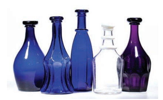
Sample of a good selection of colored, engraved, and cut decanters from the Stout collection