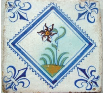
Delft tile ± 1650