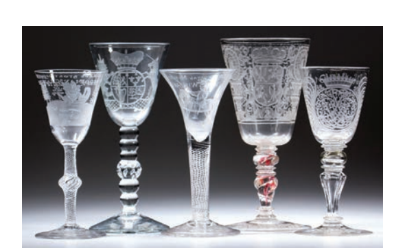
Sample of a large selection of drinking vessels from the Stout collection