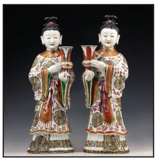
POLLY LATHAM ASIAN ART, BOSTON — Chinese Export, Eighteenth Century, figural candle holders.