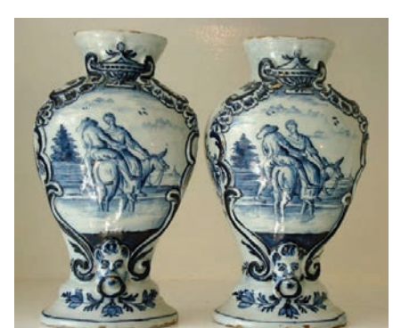
18th c. pair of Delft vases