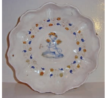
17th century Faenza Italian ceramic Tazza