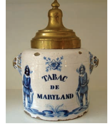
Delft tobacco Jar ±1800 Tobacco of Maryland

Lgeenen@zonnet.nL • www.antiquesdelft.com