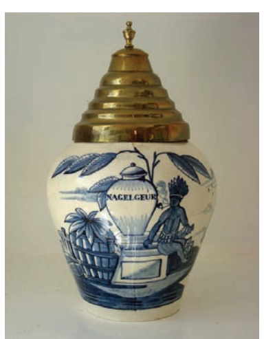
Delft tobacco Jar ±1770