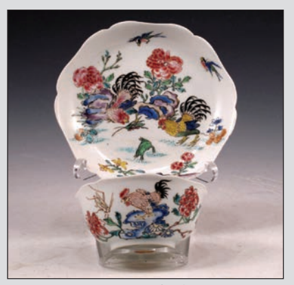
Yongzheng Cockerel Teabowl and Saucer