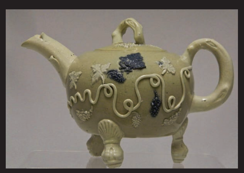
A rare English Salt Glaze Drabware Tea Pot with applied relief decoration on Three Shell form feet c. 1760 ex. Harriet Carlton Goldweitz collection. (4"H)