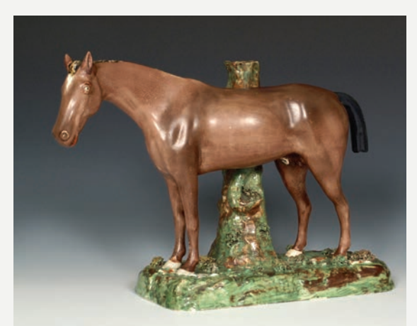
Wood & Cauldwell Pearlware Figure of a Bay Horse, c.1815, standing on a grassy base, 9".