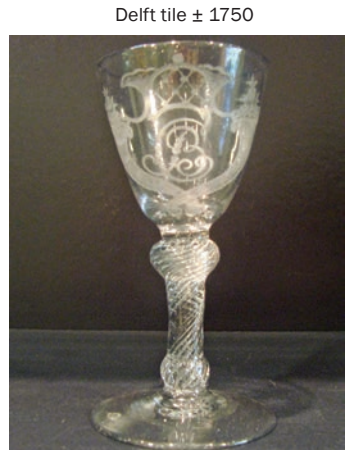
18th century glass