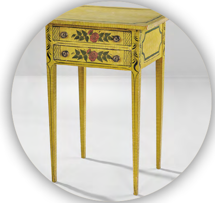
Color Is What Sells At Skinner's $2.17 Million Americana Sale