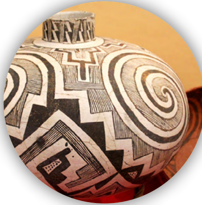
Objects of Art Santa Fe