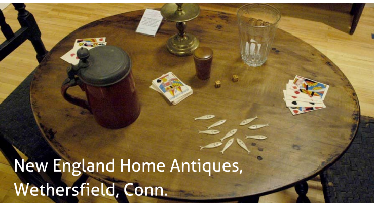
New England Home Antiques, Wethersfield, Conn.