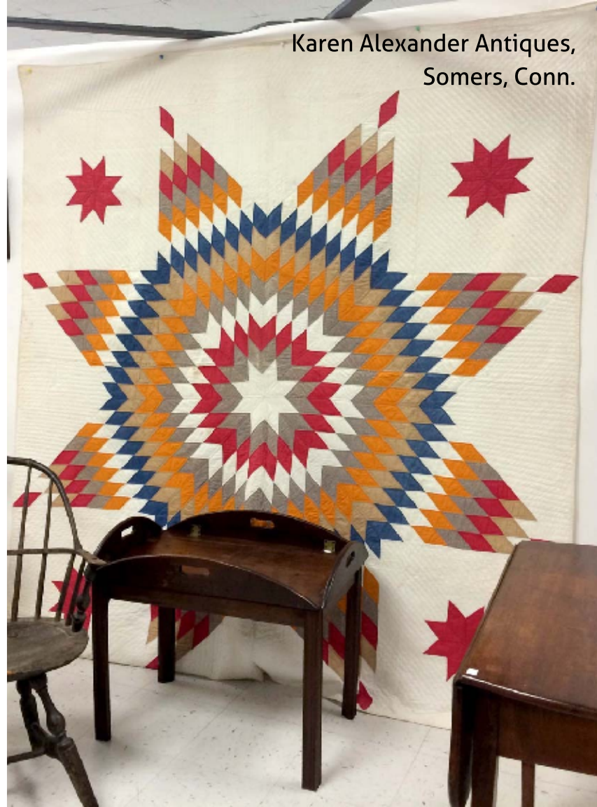
Karen Alexander Antiques, Somers, Conn.