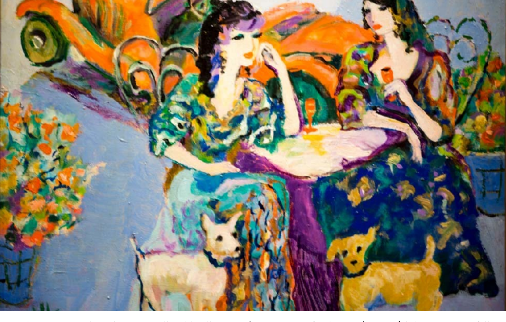
"The Orange Roadster" by Marge Mills sold well over its $700 estimate, finishing at $1,150. (Click image to see full size)