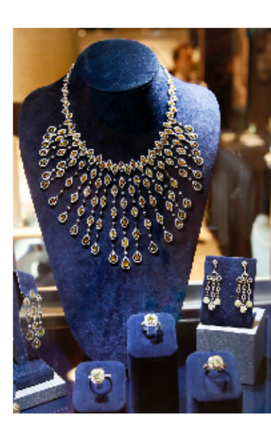
One of many booths that added a glimmer to the show was Rosenberg Diamonds, Boca Raton, Fla.