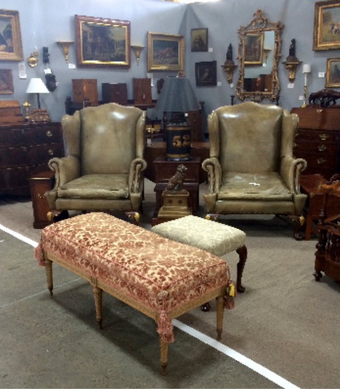
Zane Moss Antiques, New York City