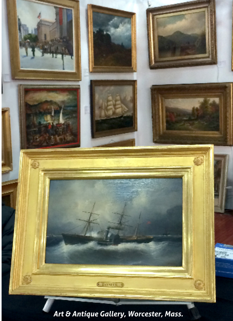
Art & Antique Gallery, Worcester, Mass.