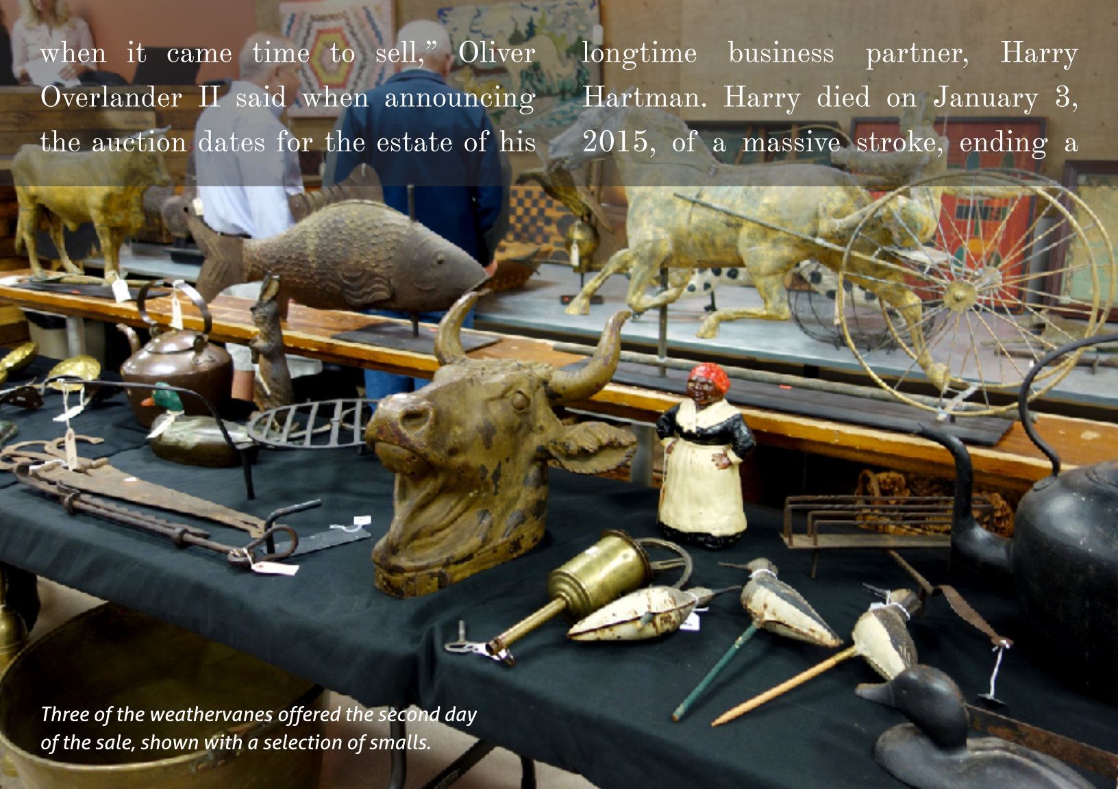
Three of the weathervanes offered the second day of the sale, shown with a selection of smalls.