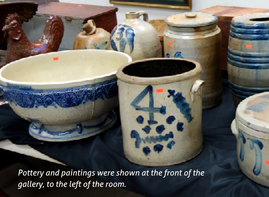
Pottery and paintings were shown at the front of the gallery, to the left of the room.