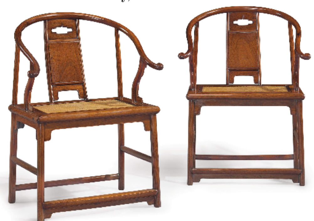
Rare set of four huanghuali horseshoe-back armchairs (two shown), Quanyi China, Ming dynasty, Seventeenth Century ($800,000–$1.2 million).

where he greeted both friends and fellow scholars, and perfected the harmonious East-meets-West design aesthetic that has influenced so many decorators since.