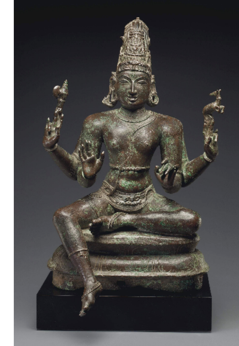
Lot #22 A large bronze figure of Shiva, South India, Tamil Nadu, Chola Period, Twelfth Century, 24 inches high

eight-day public exhibition leading up to the start of the auction series. To honor the collecting legacy of the late Ellsworth — fondly nicknamed "The King of Ming" — Christie's will recreate the sumptuous interior of the celebrated 22-room Manhattan residence, where he lived among superb examples of Asian art, blended effortlessly with English silver and antiques in his signature style. This collection, widely considered to be one of the most important private collections of Asian art ever to come to market, is expected to realize in excess of $35 million.