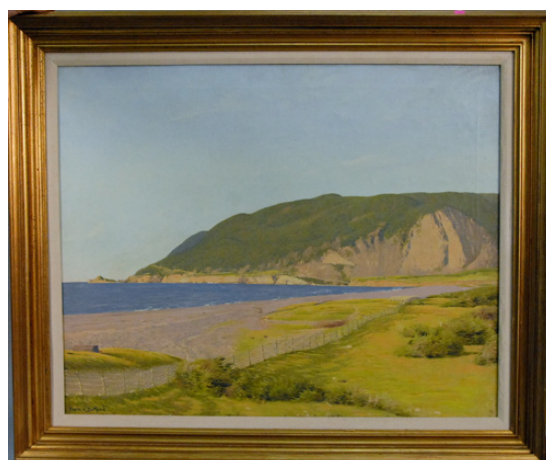
Frank Dumond 24" x 30"