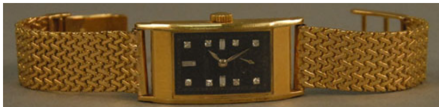
18K Patek Phillipe