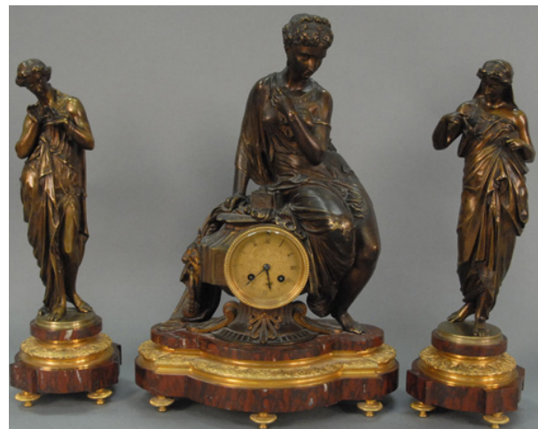
Pair of bronze & gilt bronze, Shreve Crump & Low