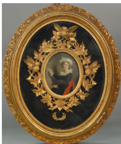
After E. V. Lebrun 26" x 22"