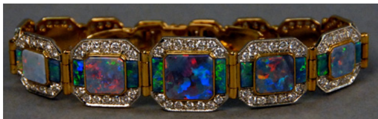
18K and opals