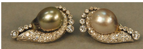
14K, Mabe pearls & diamonds