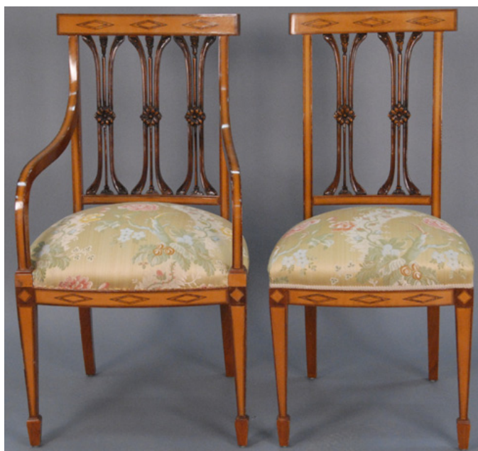
Set of 10