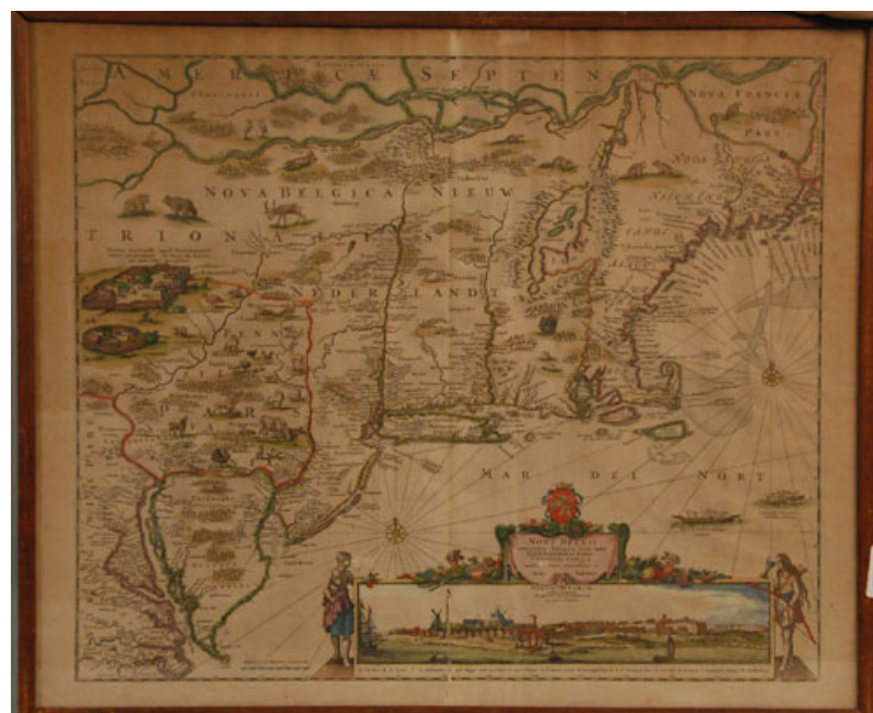
Justus Danckerts, 17th C. 18 1/4" x 21 1/4"