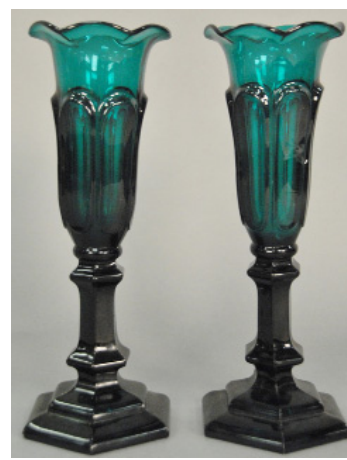
Sandwich Glass, Peacock green