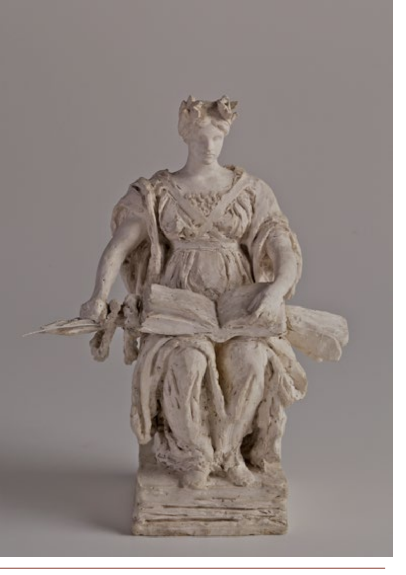
"Alma Mater, Sketch Model," 1900. Plaster, 11¾ by 8¾ by 5-1/8 inches. Designed for Columbia University's Low Library, this monumental seated figure was inspired by Columbia's official seal.

The Athenaeum is a logical venue for such a show, Dearinger observes. Not only does the institution now own two significant sculptural works by French (a large-scale plaster model for the figure of Wisdom on the Minnesota State Capitol Building was acquired earlier this year), but it also has a historical connection to the artist himself, who used to visit the Athenaeum as a student to make drawings from plaster casts in its collection. French passed his formative years in greater Boston — his family moved to Concord when he was 10 years old — and the city remained a touchstone for him throughout his career. His many public works in the area include not only "The Minute Man," but also the statue of John Harvard in Harvard Yard, whose left