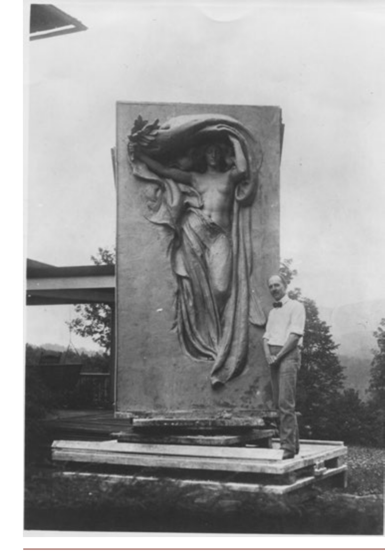
"Daniel Chester French with Full-Size Clay Model of 'Mourning Victory' on Railroad Track at Chesterwood," 1907. Upon completing the full-size plaster model for the Melvin Memorial, French exhibited it at the National Academy of Design, where it was universally praised.

Even if the works are transportable, and many permanently sited works are not, it can be prohibitively expensive and dangerous — both for the works themselves and their handlers — to ship and install them. The solution, employed by both Concord and the Athenaeum, is to make liberal use of plaster maquettes, smaller-scale bronze models and preparatory drawings (many from Chesterwood's collections), along with documentary photography of the final, full-scale works in situ, in order to "present the material in a way the public will understand it."