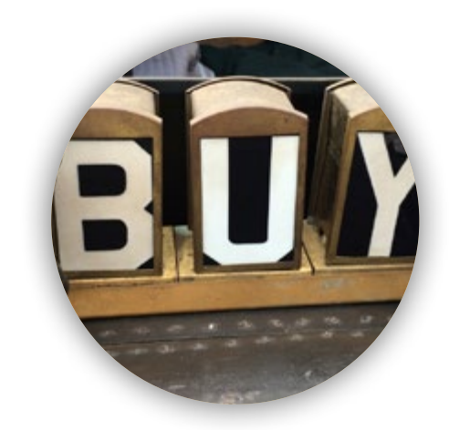
It's A Wrap On Brimfield's 2016 Antiques Market Season