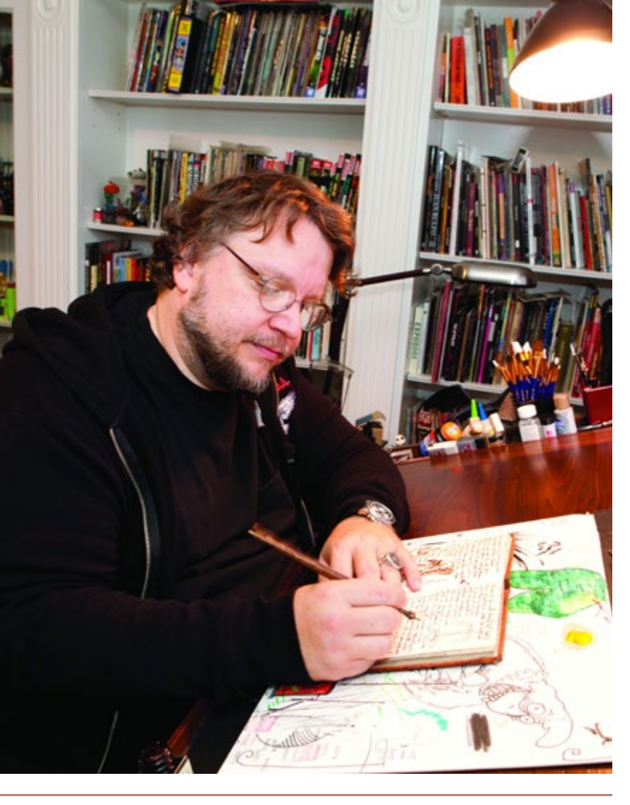
Guillermo del Toro at work on his current notebook in the Comic Book Library at Bleak House.

Jointly organized by LACMA with the Minneapolis Institute of Art and the Art Gallery of Ontario, this first retrospective of the filmmaker's work arrays sculpture, paintings, prints, photography, costumes, ancient artifacts, books, maquettes and film to create a complex portrait of a creative genius. Roughly 60 of the 500 objects on view are from LACMA's collection. More belong to the artist.