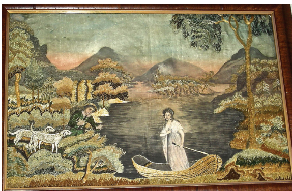
English Needlework Picture on Silk (several different kinds of stitches) with painted highlights. Wonderful use of color and perspective. Very reminiscent of a scene from "The Lady of the Lake," but with the addition of a hunter and his dogs. 1810-1820. A very sophisticated piece of needlework. 22" x 14 1/4" (sight); archival framing (26" x 18 1/4").