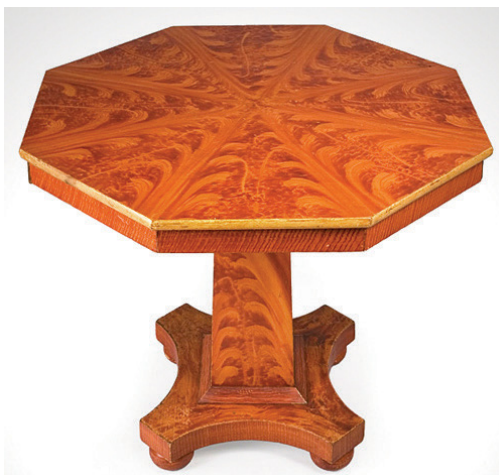
A fine painted pine table representing the best of the "Fancy Era" of American furniture. Circa 1830s.

Ackerson Homestead Antiques jbertini@aol.com • 201-803-3797