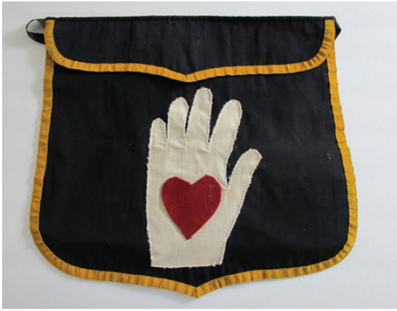
Odd Fellows Apron with Heart in Hand