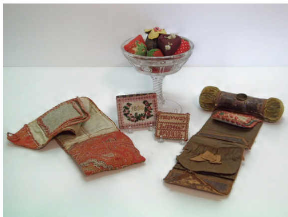
Group of needlework related items including some charming strawberry emeries, needle cases and miniature stitch decorated pincushions.