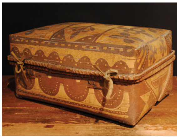
Birch bark valise, circa 1900

American Primitive Aarne Anton • 845 461 8506 americanprimitive.com