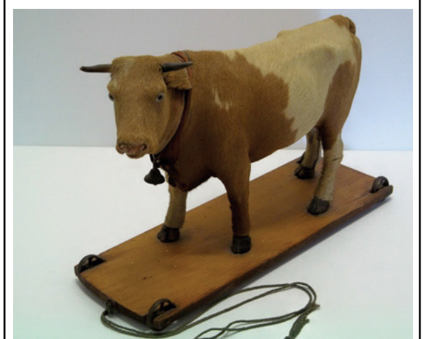
-Folk art hide covered cow on wheels; a pull toy with bell, on the original base with iron wheels. Nice condition; 12" long, 8" high.