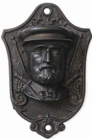
Civil War Naval Officer Cast Iron Match Holder with flags and cannons. 6" x 4".