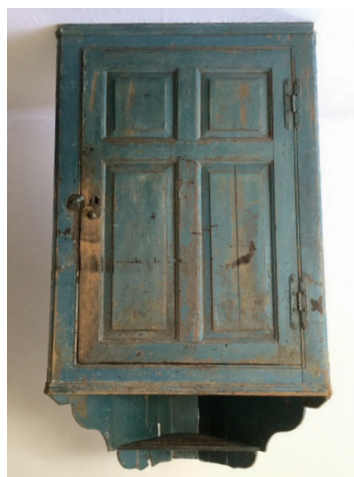
18th c. Hanging Corner Cupboard in original blue paint.