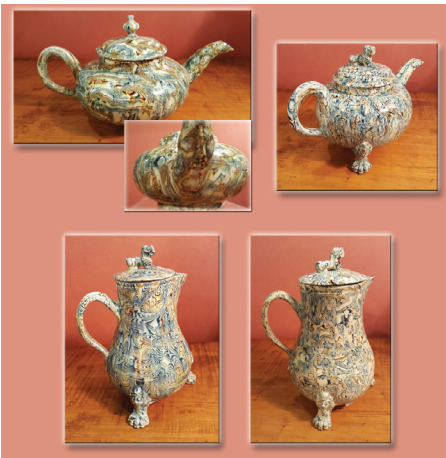
A collection of rare English Agate Tea Pots and Milk Jugs, c1750-60.