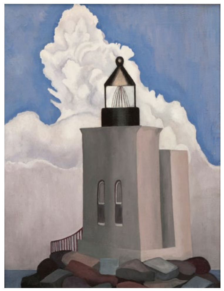
"White Cloud (Light House)" by Helen Torr, circa 1932. The lighthouse here is inspired by a real one on Long Island, but Torr greatly simplified its shape and architectural details in order to align it with her Modernist aesthetic. Oil on canvas, 26<sup>1</sup>/<sub>4</sub> by 18 inches; private collection.

challenges, despite the promises of expanded freedoms for women and for artists.