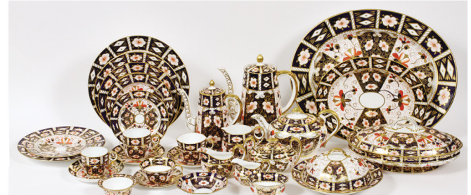
#1073 ROYAL CROWN DERBY 'TRADITIONAL IMARI' PORCELAIN DINNER & LUNCHEON SET, 159 PIECES