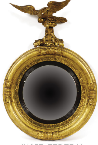
#1039 AUSTRIAN FIRST #1057 FEDERAL EMPIRE CLOCK, H 21" MIRROR, C. 1820, 36" X 25"