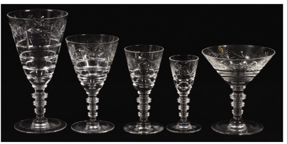
#1031 HAWKES 'LE MODERNE' ETCHED CRYSTAL STEMWARE, 63 PIECES