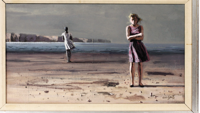
#2020 HUGHIE LEE-SMITH OIL ON CANVAS, 16" X 27"