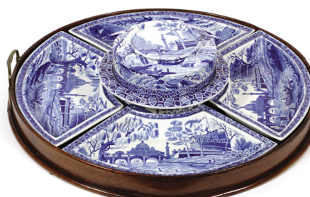
#1083 SPODE 'TIBER' SET ON TRAY, 19TH C., SIX PIECES, DIA 20"