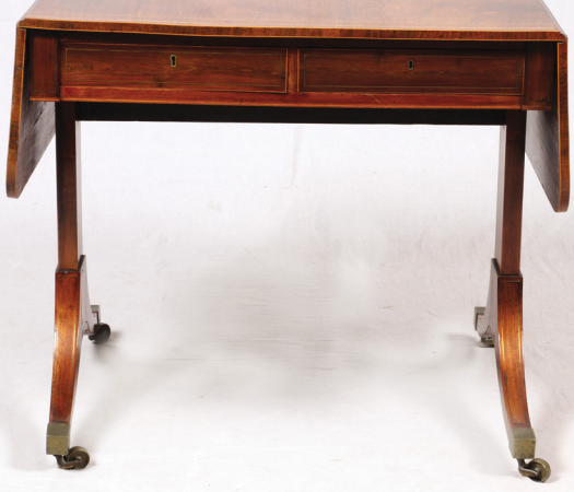
#1043 REGENCY ROSEWOOD TABLE, C. 1820, H 29", W 31"