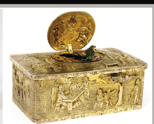
#0009 GERMAN SILVER GILT SINGING BIRD BOX, LATE 19TH C., H 4"