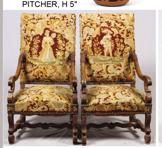
#1136 FRENCH HENRY II STYLE TAPESTRY UPHOLSTERED LORD'S CHAIRS, C. 1860, PAIR