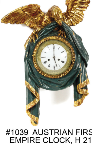
#1039 AUSTRIAN FIRST