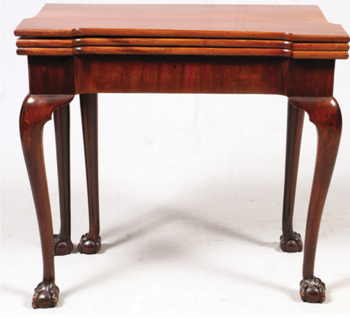
#1042 GEORGIAN MAHOGANY GAMES TABLE, 18TH C., H 27 1/2", W 31"