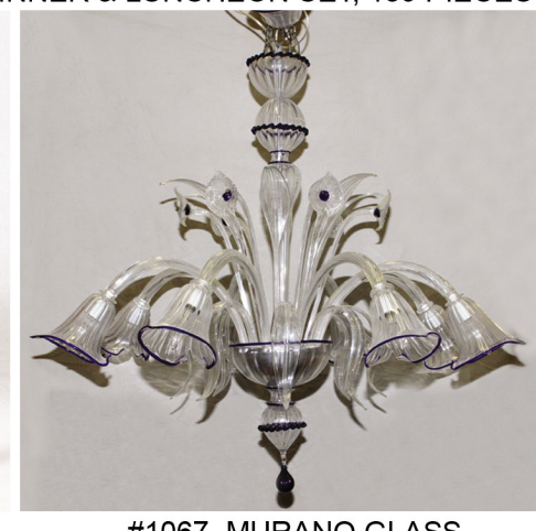
#1067 MURANO GLASS EIGHT-LIGHT CHANDELIER, H 40", DIA 40"