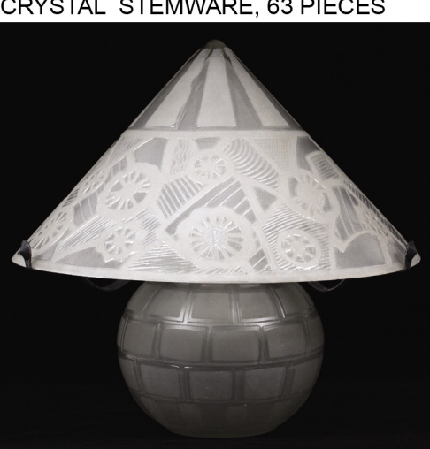
#1036 DAUM ART GLASS LAMP, H 16 1/2", DIA 17"