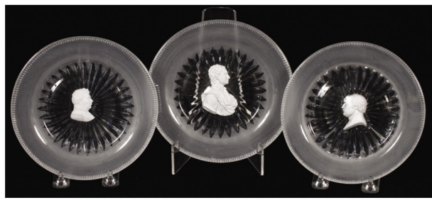
#1037 FROSTED GLASS & SULPHIDE CAMEO PLATES, C. 1830, 3, DIA 6 3/4"