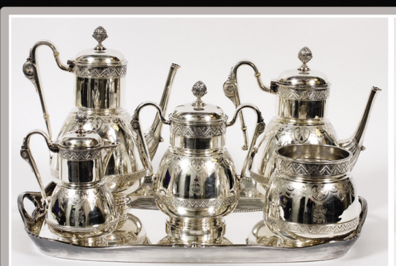
#1001 TIFFANY & CO. STERLING TEA & COFFEE SET, C. 1854-69, FIVE PCS., 550 BROADWAY, & A TRAY

VIEW ENTIRE CATALOG ONLINE June 12th-14th Auction