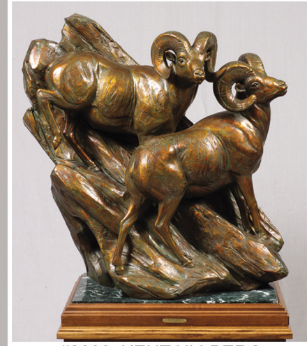
#2033 KENT ULLBERG [SWEDISH, B. 1945], BRONZE SCULPTURE, H 33" W 43"