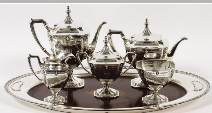
#1002 FRANK SMITH CO. 'GEORGIAN GARLAND' STERLING TEA & COFFEE SET WITH DURGIN TRAY, C. 1920, SIX PIECES