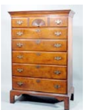
Choice Chippendale curly maple tall chest, c. 1780

Day 1: A very general description: Beginning at 1pm : 400 Lots including country accessories & furniture, clean custom furnishings, Civil War related including photos, letters, swords, rifle, cannon balls, bullets and more, antique firearms shotguns and rifles, art work, toys & children related items including early board games, antique dolls, and cast iron toys, china & glass, silver and costume jewelry, Leica cameras; plus much more. Items will be sold at random or requests welcome. A complimentary barbeque opens at 12 noon, refreshments served.