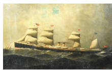
Large oil, ship, The SS Germanic 1875, by Antonio Jacobson

To make your trip to Plainfield, NH more desirable, we have scheduled a 2 day auction. Day 1, Sunday, will be held under tents and Day 2, Monday, will be held in our gallery. An interesting selection of estate goods from many prominent local estates will be up for bids, so please plan to attend.