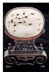
Jade carved medallion

Please note many new estate arrivals to be sold, not listed