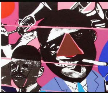
detail: Romare Bearden Jazz II Deluxe