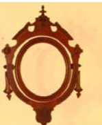
MT shaving stand (Estate)