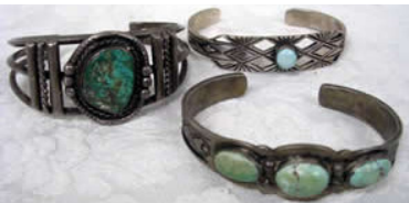
Sterling cuffs with turquoise

Our mid-summer sale features a St. Johnsbury, VT Estate which had Berlin, NH & White Mountain connections, the partial contents of a beautifully appointed MA home "downsized" in a move to Vermont, and small consignments from other area homes.