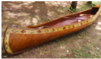
The best 16' Old Town canoe