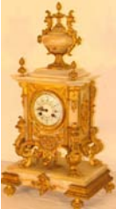
Awesome 2' bronze & onyx clock w/griffins (Estate)