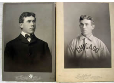
Chicago Cubs Pat Moran