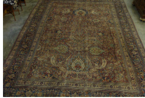
1 of several Oriental estate rugs