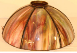
Rare Gustav Stickley shade #262 (picture early work of G Stickley, page 153) (Estate)

Many items from a Leeds, NY farmhouse estate. Over a dozen pieces of antique Adirondack furniture from a Stockbridge log cabin. Terms: Visa, MC, Discover 18% Buyer's Premium - 15% for cash or good check. Absentee bids accepted.