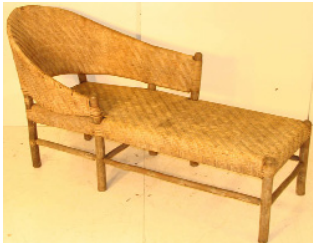
Over a dozen pieces of signed Old Hickory (1927) (Estate)