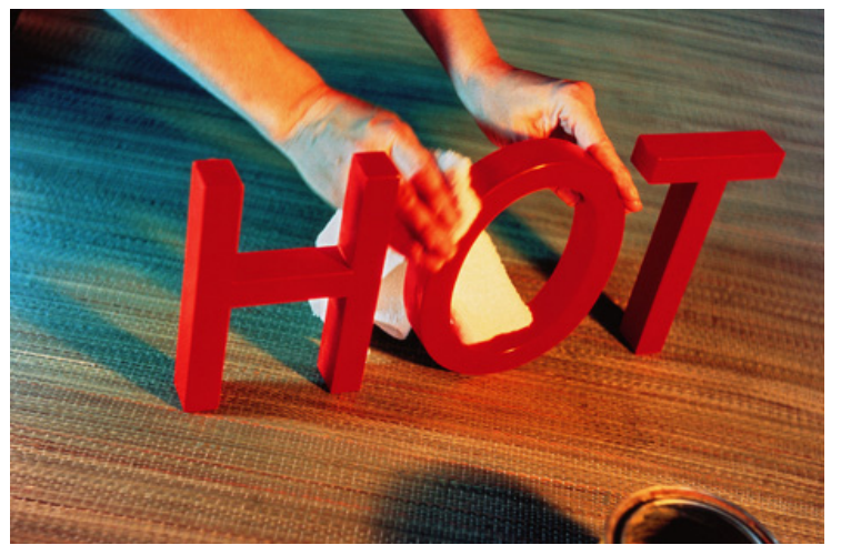
Bruce Nauman (American, b 1941), “Waxing Hot” from the portfolio “Eleven Color Photographs,” detail, 1966–67/1970/2007, inkjet print (originally chromogenic color print), 19 15 / 16 by 19 15 / 16 inches. Museum of Contemporary Art, Chicago. ©2010 Bruce Nauman/Artists Rights Society (ARS), New York

The Museum of Modern Art is at 11 West 53rd Street. For information, www.moma.org or 212-708-9400.