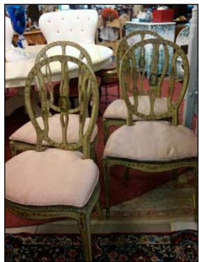
Adams Hepplewhite side chairs (4) c 1770