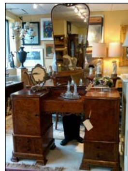
Art Deco vanity/mirror, c 1920