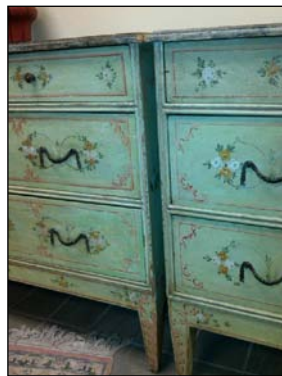
Mediterranean painted commodes, pair c 1920