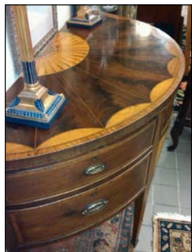
Antique George III sideboard, 54" long

Charles Roux 1920 poster 5'x 8'. Also vintage Portuguese needlepoint rugs, Eric Holch lithograph, oak harvest table, Kerns-Wilcheck sink/vanity/mirror, pr. alabaster column lamps, vintage Steuben 15" giraffe, Lalique dessert set, Massena Baccarat glassware, 7'leather room divider, Miriam Haskell earrings, accessories include lighting, artwork, carpets, sterling, etc.