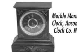
Marble Mantle Clock, Ansonia Clock Co. NY