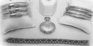
Collection of Vintage Jewelry

AUCTION: SATURDAY, JULY 17TH, 2010 AUCTION BEGINS 10AM • DOORS OPEN 9AM LOCATION: 330 REHOBOTH AVENUE, REHOBOTH, DE