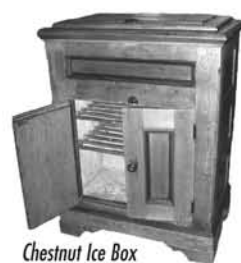
Chestnut Ice Box