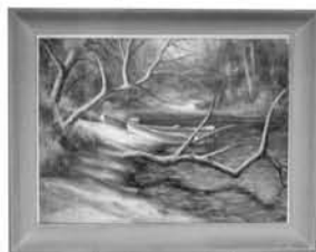
Watercolor by Howard Schroeder