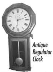
Antique Regulator Clock