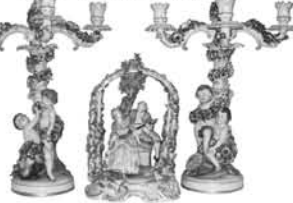
Collection of Von Schierholz Porcelain

AUCTION: SATURDAY, JULY 17TH, 2010 AUCTION BEGINS 10AM • DOORS OPEN 9AM LOCATION: 330 REHOBOTH AVENUE, REHOBOTH, DE