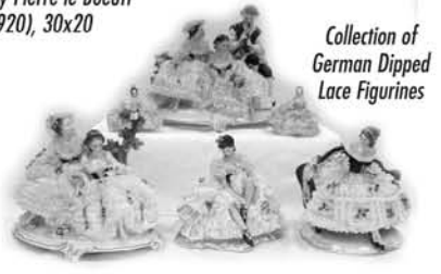
Collection of German Dipped Lace Figurines

Jewelry: (Partial Listing) 14KYG Emerald & Diamond Ring; 14KWG Pearl Necklace 9x9.5mm; 14KWG Antique Diamond Ring 5 Full Cut Dia= approx .35cts., 16 Single Cut Dia=approx .64cts.; 18KYG & WG Dia Necklace 34CanaryDia=approx .65cts., Pear Shaped Canary=.18cts., & 45Br=.45cts.; 18KYG Dia Ring Containing 1 Emerald Cut Diamond = 2cts., J/K VS2, 25BG= 2cts H/I VS1, 10Br= .50cts.; 18KYG Ruby & Diamond Bracelet 102 Rubies=16.18cts and 21Dia=1.04cts; 14KYG Blue Topaz Ring; 18KYG Bracelet Weighing 45.55 grams; 14KWG Marquise Cut Diamond Ring Dia=3.89cts., G, I2; 14KWG Diamond Cross Pendant 11 Dia=4.30cts., G/H, VS; 14KWG Diamond Bracelet 134 Radiant Cut Diamonds= 7cts., H/I, VS1; 14KYG Dia Ring, Dia=2cts., J/K, VS1; 14KWG Diamond Bracelet 500 Baguette Cut Diamonds= 2cts.; 18KWG Ruby & Diamond Ring, Ruby=5.03cts., 18 Dia =.66cts; Antique 14KYG Waltham Pocket Watch Huntercase, 1891