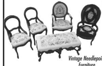
Vintage Needlepoint Furniture